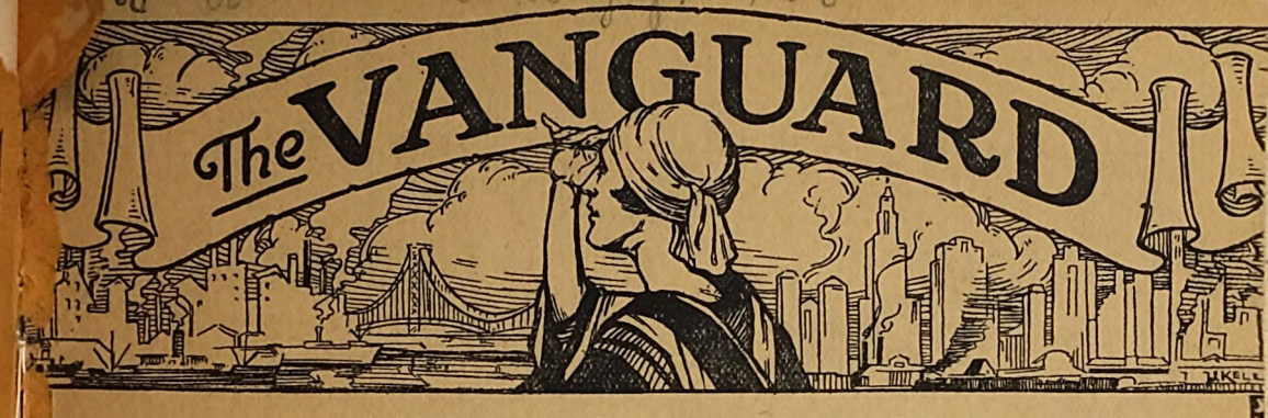
A Magazine of Progressive Jewish Life