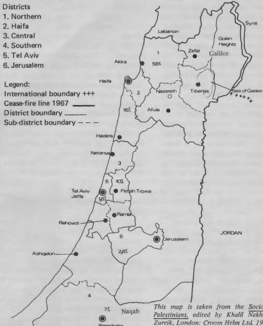
Distribution of Palestinians living in 'Israel' in 1975 by district

are paying you your wages as a 'watchman'...You have 'looked after' our land for 2,000 years and we are paying you your wages, but the land is ours" 3