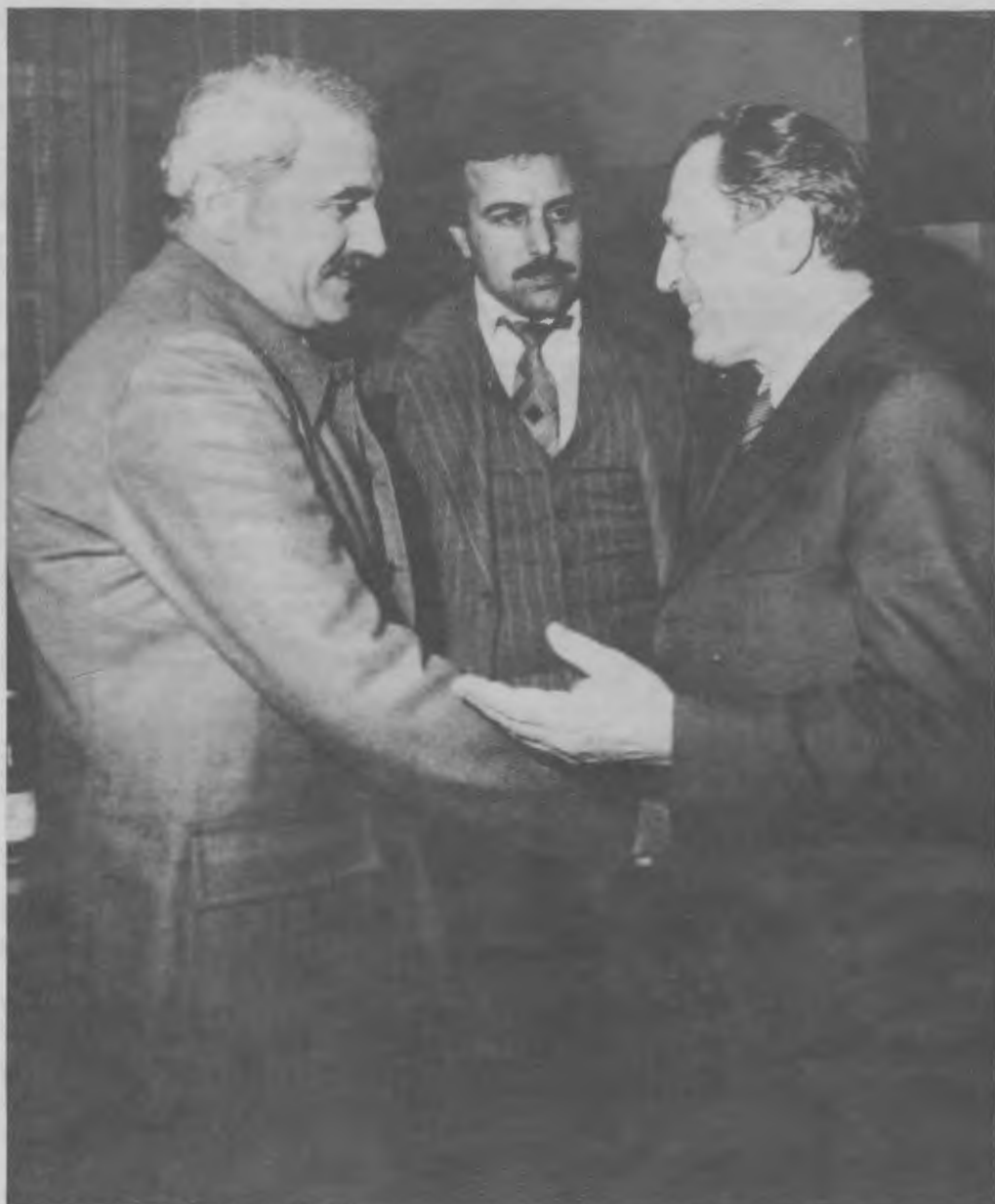
Comrade George Habash meeting with Comrade Bilak, Secretary of the Central Committee of the Communist Party of Czechoslovakia, in early February. Comrade Habash is now visiting some of the patriotic Arab countries.