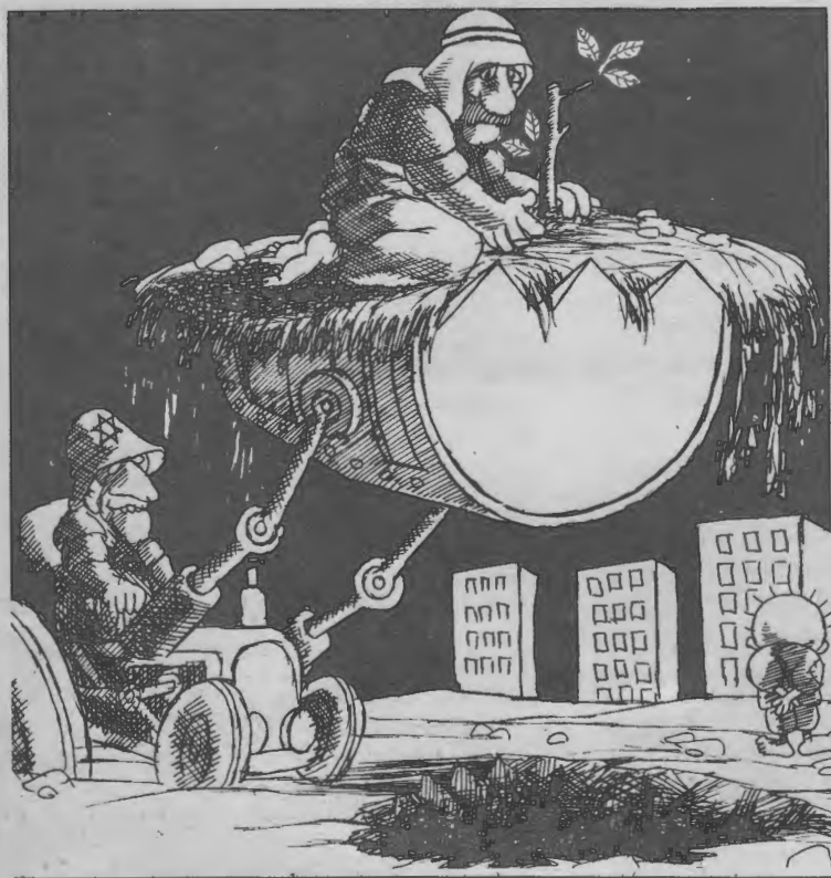
Employed Palestinian Arabs Aged 14 years and over Pre-1967 Occupied Palestine

The following chart reflects the change in occupation of Palestinian Arabs in 'Israel':