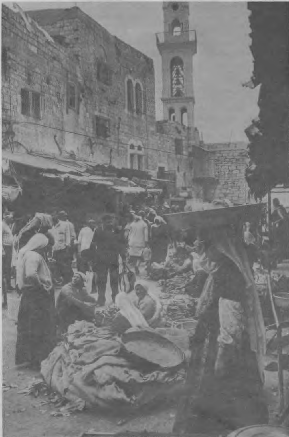
The market in Nazareth

On the economic level as well, the Zionist entity literally reaped the benefits of the Palestinian disaster. On August 1, 1948, the Israeli Foreign Minister issued a statement to the effect that it was "economically unfeasible" to allow the return of the Arabs.