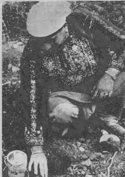
Unpaid agricultural labor

The increased percentage of working women in the seventies was accompanied by diversification in their occupations. In the early sixties, the few with employment outside the home and family were concentrated in fields traditional for women, such