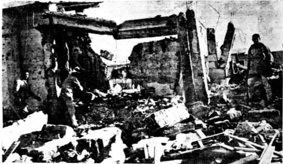
The ruins of the Egyptian school

Only six weeks before, in February, Israeli aircrafts bombed a metal-works factory near Cairo killing 86 workers and wounding over 100. That time the Israeli authorities claimed that it was a "technical error". One couldnt but be reminded of the numerous "technical errors" of the Americans in Vietnam killing scores of Vietnamese men, women and children in the process. Israel came up with a different story this time to justify their wanton murder of Arab children. The Israelis claimed that Bahr al Bakar, the village bombed was in fact a military establishment and that it is the Egyptians who are to blame for putting the school right in the middle of it. What atrocious logic, the logic of gangsters. The facts of this raid show that it was carried out both with impunity and precision. The raid was carried out in daylight. Only the school, a one-storey building was destroyed while other buildings surrounding it, including an office block adjoining were hardly touched. Western correspondents who visited the village after the attack reported that the school was part of a set of concrete buildings. The five classrooms were attached to an office block used by the sites (an agricultural site) engineers. "Whereas the school was levelled, the office blocks escaped with only window and furniture shattered" (Times April 13th). The Zionists were obviously after a prime military target, Bahr el Bakar Primary School and succeeded in their mission of April 8th.