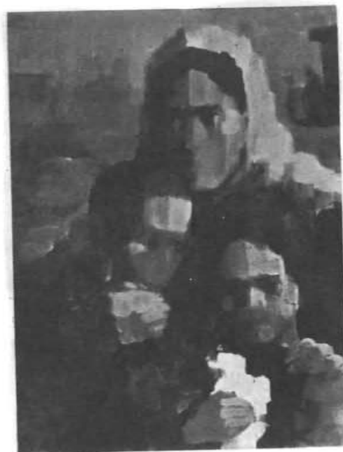
Mother and Children

ISSUED BY : Directorate of Moral Guidance, Palestine Liberation Army, Damascus ( Syria ).