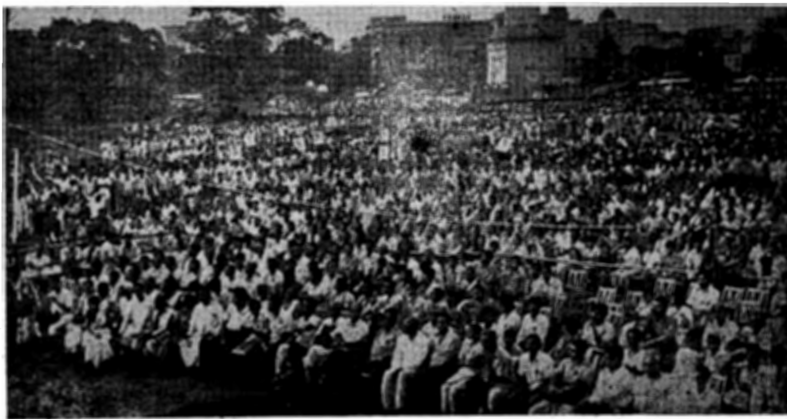
Below : A portion of the mammoth gathering.