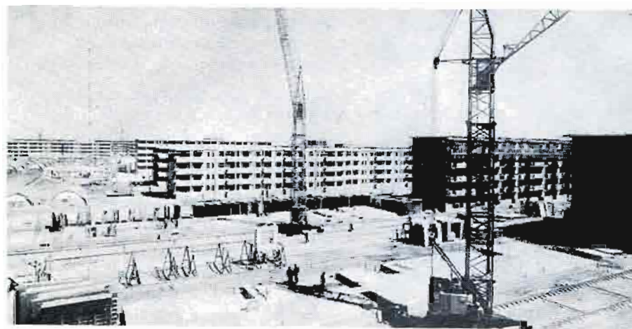
Part of the new Tangshan under construction.

The emergence of unhealthy and unsavoury trends in society is one of the evil consequences left over from the ten-year (1966-76) turmoil. To revive good social morality and conduct will take some time and much effort. Today, the abnormal situation that the good people are afraid of the wicked still exists in some places. Local governments at all levels are making great efforts to enforce law and order. The Party has called on all the people to carry forward the Party's fine traditions so as to foster and promote healthy trends.