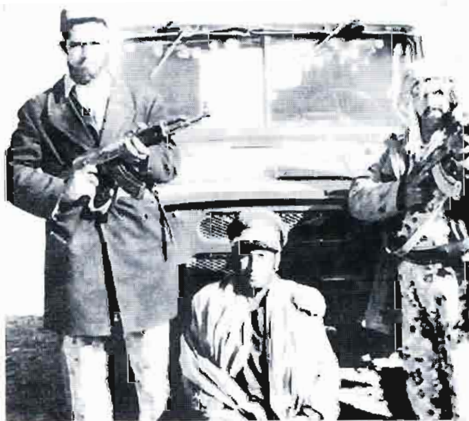
Afghan guerrillas with a captured Soviet vehicle and an Afghan government army officer.

• Soviet occupation of non-aligned Afghanistan has hurt the non-alignment movement. Cuba and Viet Nam, Soviet proxies