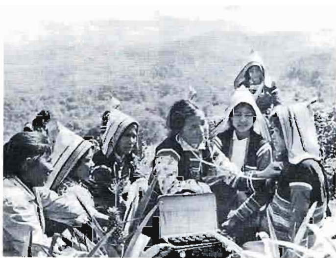
A Jinuo doctor examining a peasant.

The Jinuos have their own spoken language and customs. The men are reputed to be good hunters, an occupation they pursue not only to procure food but also to evince their bravery. Their prey includes hornbills, wild elephants and other rare species which roam the primeval forests of the Jinuo Mountains.