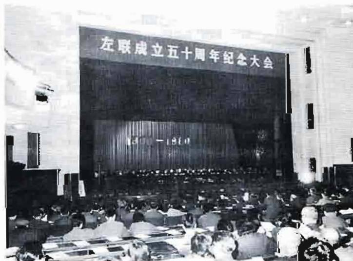
A Beijing meeting marking the 50th anniversary of the Left-Wing Writers' League.