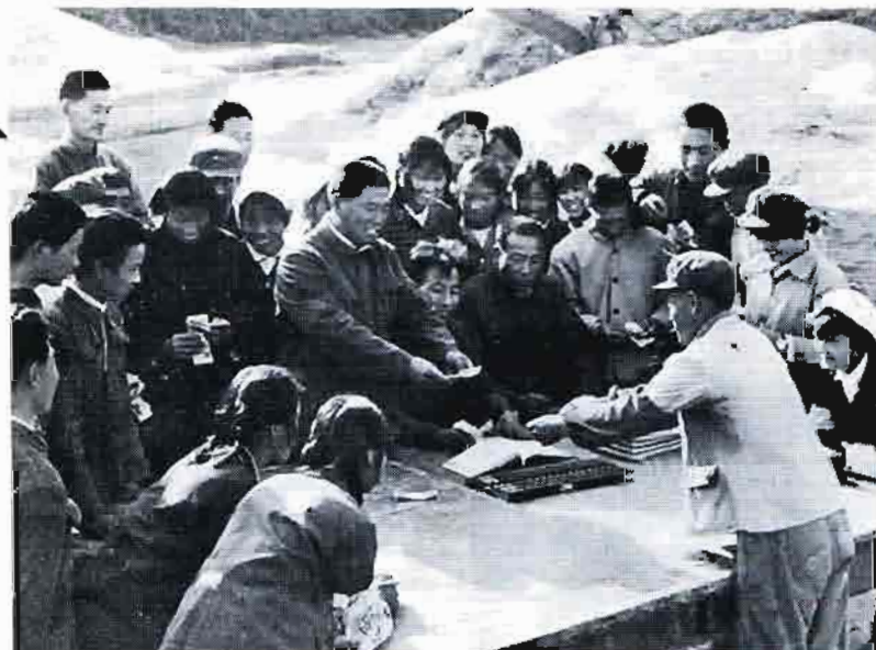
A state farm in Anhui Province has increased its profits for several years running. Picture shows the farm workers receiving bonuses for overfulfilment of their production plan.

Of the 5.09 million square metres already completed, housing accounts for 2.16 million square metres, and 30,000 fam-