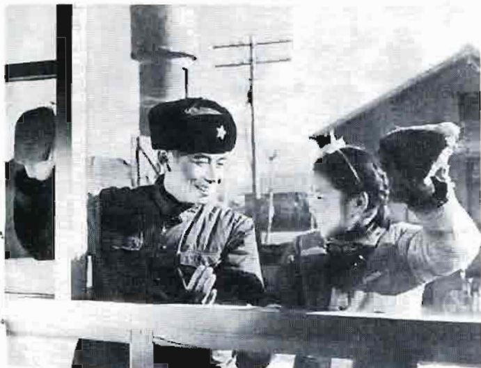
A young pioneer lending a hand to an armyman.

feel remorseful but refuse to mend their way. Correct guidance at this moment can help them regain their courage. The teacher's role should be to discover and encourage their good points so that they take pre-eminence over other less positive characteristics.