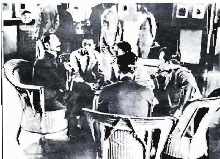
Lu Xun chatting with young woodcut artists at an exhibition in 1936.

With the Chinese Left-Wing Writers' League as the nucleus, the movement started the sys-