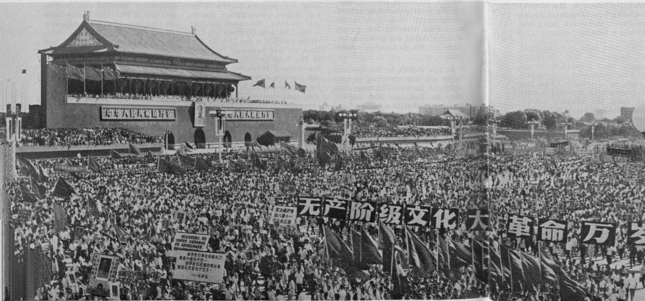
A section of the million-strong mass rally.

the wisdom and strength of the masses of the people!