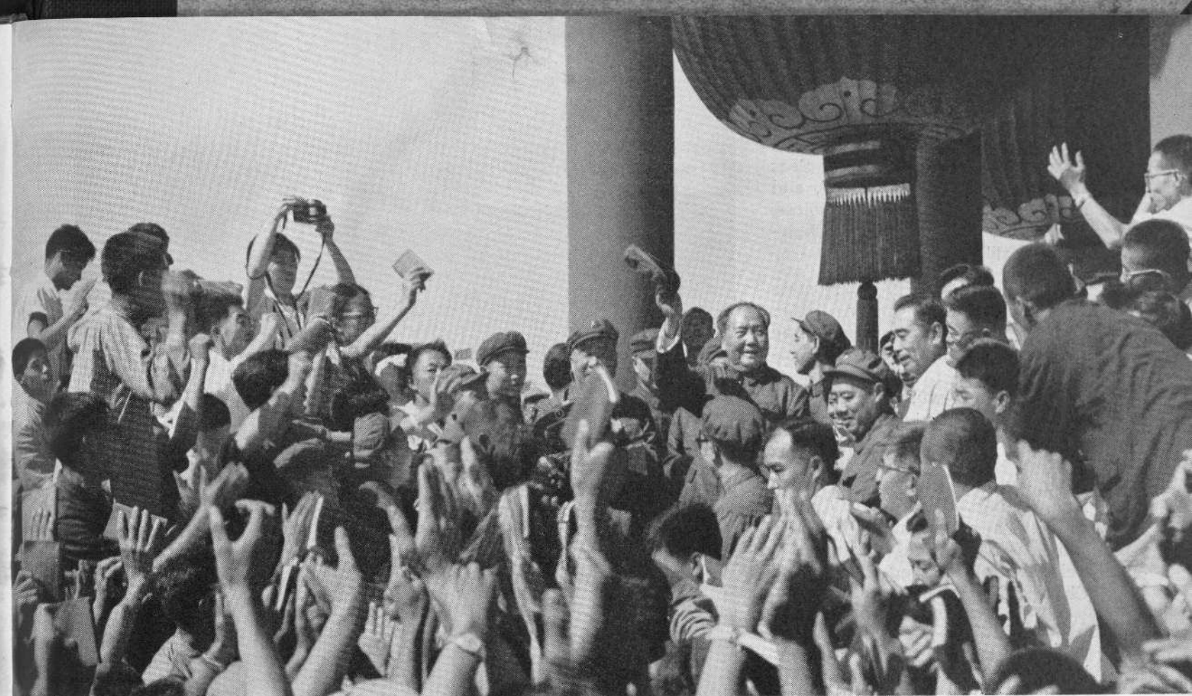
Revolutionary teachers and students from Peking and other parts of the country warmly acclaim Chairman Mao.