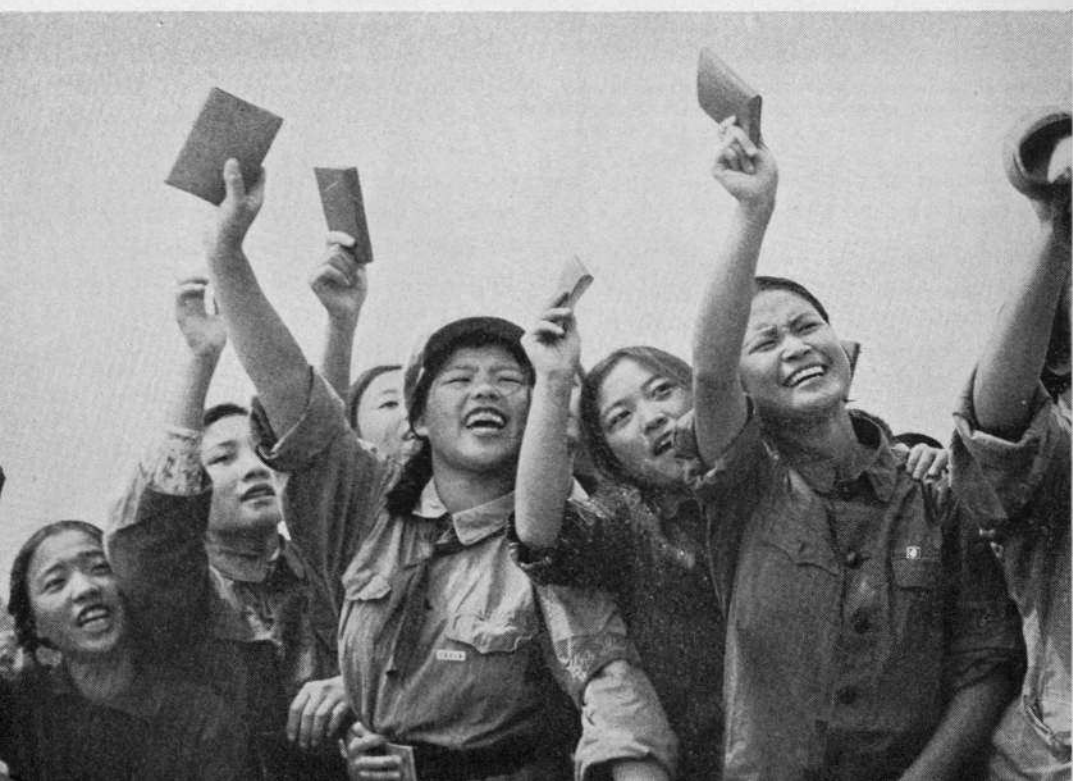
These young Red Guards dare to charge forward and dare to make revolution.

He pointed out: "The 16-point decision concerning the great proletarian cultural revolution adopted by the session was formulated under the personal leadership of Chairman Mao. It is the programme of the great proletarian cultural revolution. All revolutionary comrades should conscientiously study it, become familiar with it, grasp it and apply it. It is the weapon with which we fight in the great proletarian cultural revolution and our compass for action. We must study and apply this great programme well and carry it through in our practical actions.