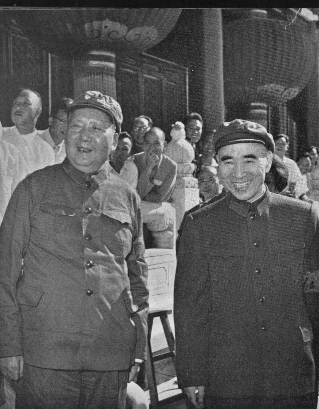
Chairman Mao and his close comrade-in-arms Comrade Lin Piao stand side by side.