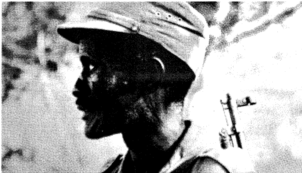
PLAN militant.

More important perhaps is the strategic aspect of Namibia's value to imperialism. Lying to the north of South Africa, it serves as a buffer zone against guerrilla activity; SWAPO, conversely, represents the ruin of this cordon sanitaire . A truly independent Namibia would provide South African ANC (African National Congress) guerrillas with a friendly border, thus accelerating the demise of the South African white-minority regime.