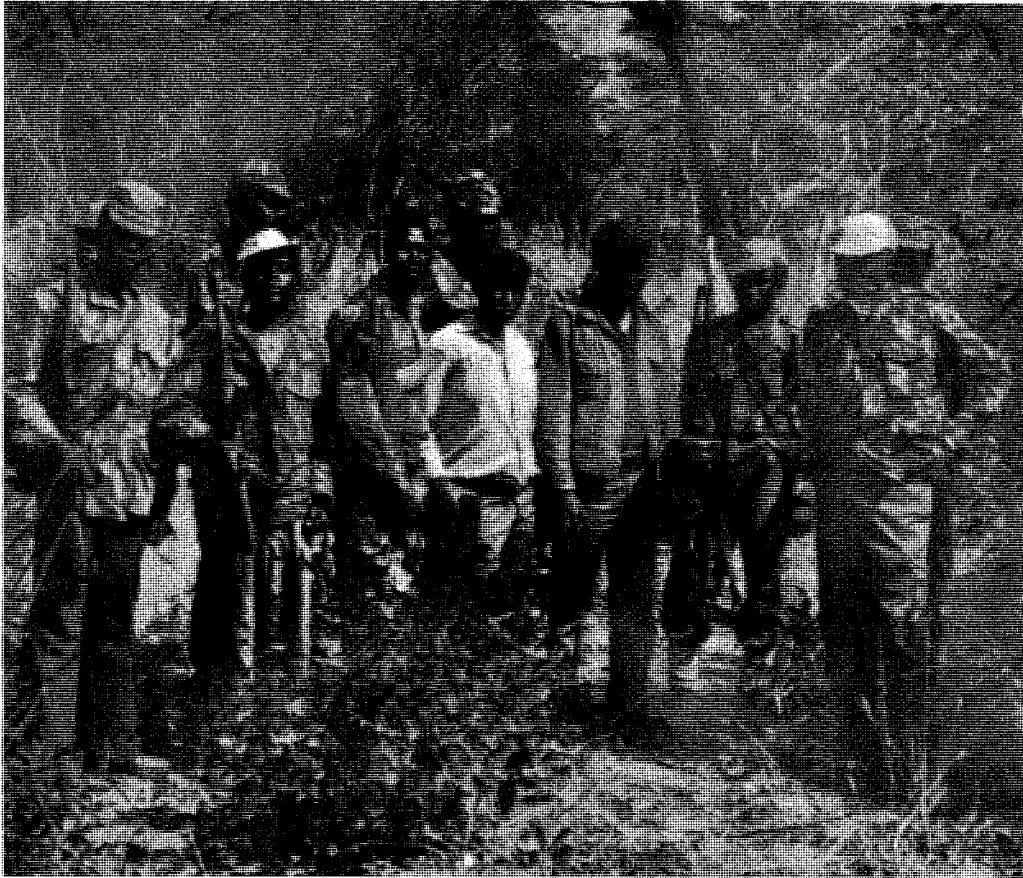
People's Liberation Army of Namibia (PLAN) guerrillas.