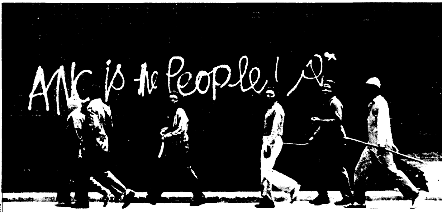
ANC: The writing is on the wall