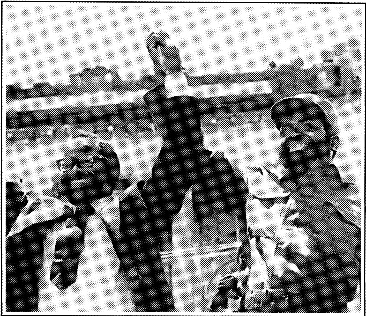
Oliver Tambo (left), president of African National Congress and Samora Machel (right) president of Mozambique

moves in Southern Africa. 'Deal will erode Soviet power in Africa.' The thesis was backed by a document supposedly captured in Grenada six months before by the Americans. It was said to be a record of a conversation between the Angolan Foreign Minister and a Grenadian official in which Paulo Jorge supposedly described his government's 'disillusion with Swapo, which it blamed for much of the deterioration in the Angolan economy.' It is impossible to believe that the Sunday Times could have believed such a crude, and conveniently available, document was genuine.