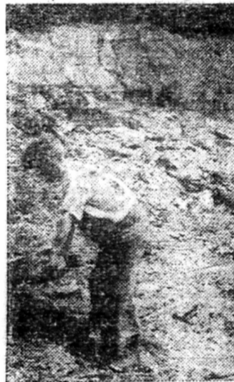
Photo shows child of unemployed coal miner in the Anthracite combining dumps for pieces of coal. His father slaved years at starvation wages to dig the coal — now he has been laid off and his family must freeze. Miners and miners' wives must fight for immediate unemployment relief and unemployment insurance.