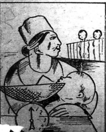
IN THE SOVIET UNION TRAINED NURSES CARE FOR THE CHILDREN OF WORKING MOTHERS.

An excellent opportunity for us to rally the women to our standards is presented by International Women's Day on March 8. This day will be the occasion for demonstrations and organization work of all kinds in every country. With even a little work on our part large numbers of women in American industry can be aroused in connection with the general movement and drawn closer to our program and organization. We must make International Women's Day a big success. It must be the point from which a new era in our work among women will date.