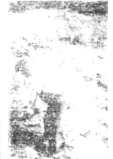
Photo shows child of unemployed coal miner in the Anthracite combing dumps for pieces of coal. His father slaved years at starvation wages to dig the coal...