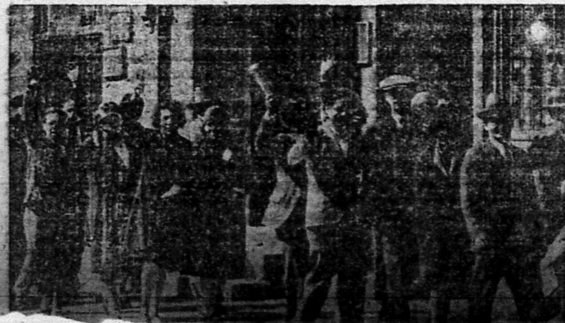
Photo shows women textile strikers side by side with men on picket line. Such mass picket lines are daily scenes in Lawrence, Mass., where 10,000 textile workers, under the leadership of the National Textile Workers Union, are on strike against speed-up and starvation wages.