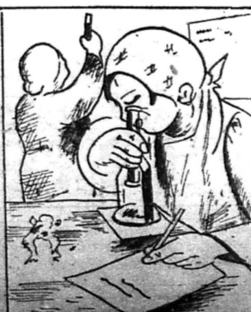
IN THE WORKERS' FATHERLAND THE WORKERS ARE THE ONES WHO SECURE EVERY CULTURAL ADVANTAGE.