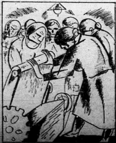
IN THE U.S.A. WOMEN NOT ONLY WORK LONG HOURS FOR LITTLE PAY BUT MUST DO NIGHT WORK UNDER INTOLERABLE CONDITIONS

gle organizations of the working class—militant trade unions and Unemployed Councils. Class conscious women are needed to help mobilize their working sisters who still belong to the neutral masses under the bonds of capitalist suppression and church-sponsored ignorance. These women must join the Red Front of working class struggles.