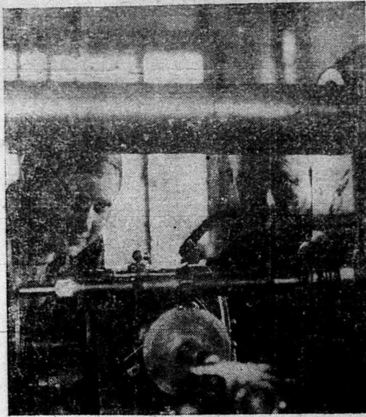
The Soviet workers run the factories. The women workers have special advantages, such as shorter hours, etc. They go to school in the factories they work in, as in the photo above, which shows women workers in the factory school at the Moscow Motor Car Factory. She is being trained to help direct the factory. See photo on next page for contrast in capitalist U. S. A.