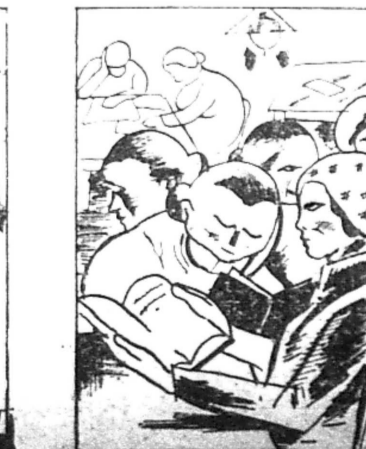
IN THE SOVIET UNION NIGHT WORK HAS BEEN ABOLISHED. WOMEN WORKERS HAVE THE 5 AND 7 HOUR DAY.