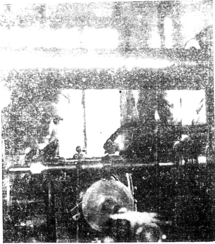
The Soviet workers run the factories. The women workers have special advantages, such as shorter hours, etc. They go to school in the factories they work in, as in the photo above, which shows women workers in the factory school at the Moscow Motor Car Factory. She is being trained to help direct the factory. See photo on next page for contrast in capitalist U. S. A.