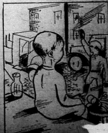
IN THE U.S.A. CHILDREN ARE LEFT CARE FOR THEMSELVES AND MUST GO TO WORK