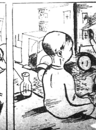
IN THE U.S.A. CHILDREN OF THE WORKING CLASS MUST CARE FOR THEMSELVES WHILE THE MOTHER IS AT WORK.

organization of the working class militant trade unions and Unemployed Councils. Class conscious women are needed to help mobilize their working sisters who still belong to the neutral masses under the bonds of capitalist suppression and church-sponsored ignorance. These women must join the Red Front of working class struggle.