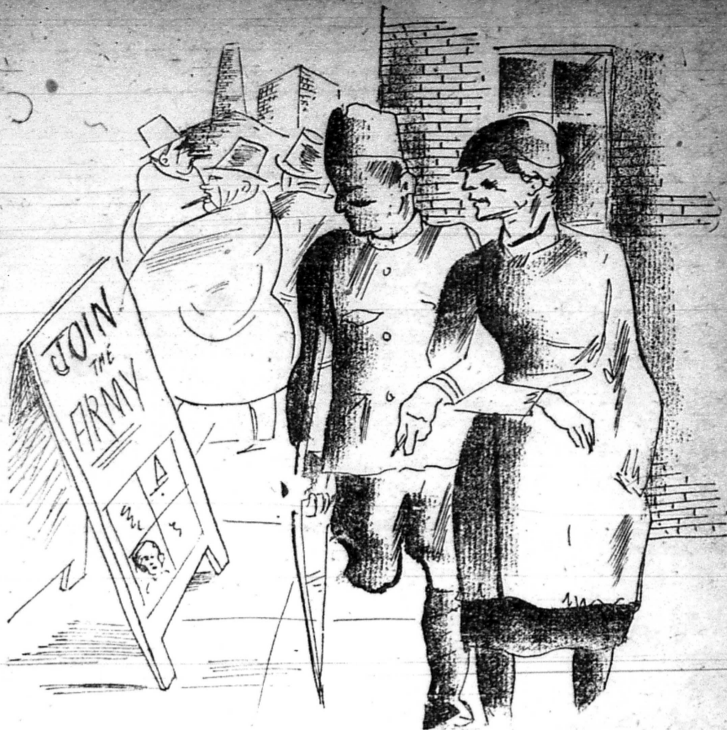
Millions of workers were forced to kill and maim each other in the last imperialist world war, so that the bosses could become richer. Now the bosses are preparing another world slaughter—probably an attack on the Soviet Union, where there is no unemployment. They plan to use the working women in this attack. Working men and women, turn the guns on the bosses in the coming war!