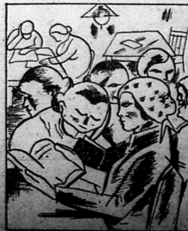
IN THE SOVIET UNION NIGHT WORK HAS BEEN ABOLISHED. WOMEN WORKERS HAVE THE 8 AND 7