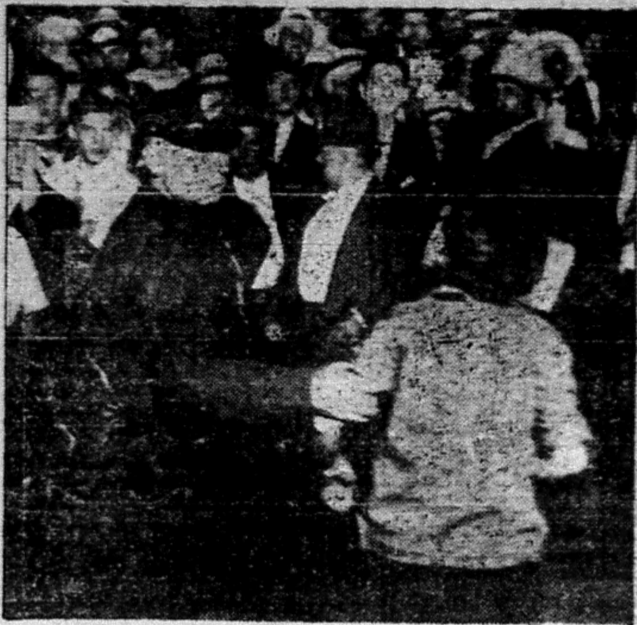
Women workers fought in many demonstrations and hunger marches on Feb. 10th and on Feb. 25th. Photo shows arrest of unemployed woman worker in a recent jobless demonstration.