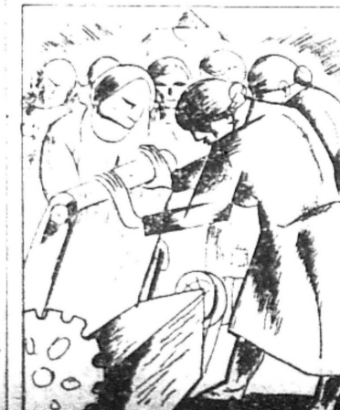
IN THE U.S.A. WOMEN NOT ONLY WORK LONG HOURS FOR LITTLE PAY BUT MUST DO NIGHT WORK UNDER INTOLERABLE CONDITIONS.

Working Women Will Resist. The women workers are forced to work today under the oppression of the capitalist class and the W. R.