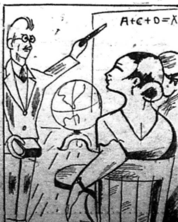
IN THE U.S.A. ONLY THE RICH CAN STUDY. WORKERS HAVE TO LEAVE SCHOOL AT AN EARLY AGE TO MAKE A LIVING.