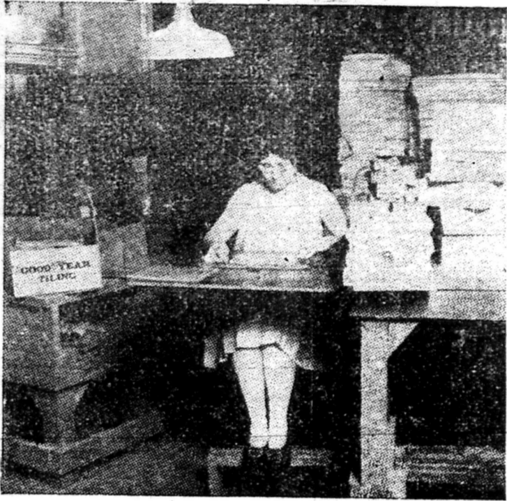
Woman worker in a Goodyear Rubber factory in U. S. A., working under speed-up for starvation wages. Hundreds of thousands of women workers are unemployed and starving in the U. S. A. More and more of them are joining the revolutionary trade unions to fight starvation.