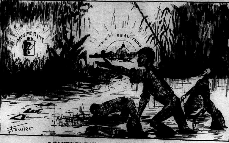
IN THE REPUBLICAN SWAMP: CHASING THE 'IGNIS FATUUS' AT $1.50 A DAY.

One fact should never be lost sight of in computing the Socialist vote. The recorded vote, the vote cast, is at least 50 per cent below the number of voters. At least 50 per cent of the Socialist voters are disfranchised by reason of residence qualifications. It is a rank discredit to all appearance of fairness to require one year's residence in the state as a qualification for voting. This provision of the statute is aimed directly at working men, who are obliged to travel constantly in search of jobs.