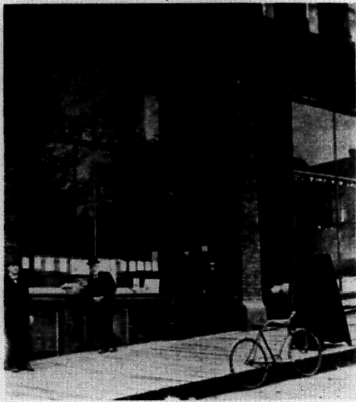
OFFICE OF THE SOCIALIST

In Seattle less than five per cent. of our school population ever reach the high school and less than one per cent. graduate therefrom. But even these figures, small as they are, do