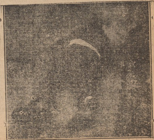
A wounded miner lying on the roadway at Wildwood, Pa. Despite the massacre and terror of the gunmen, another mass picketing demonstration is to be held at this mine. The miners are undaunted and are determined to die fighting rather than to die starving.