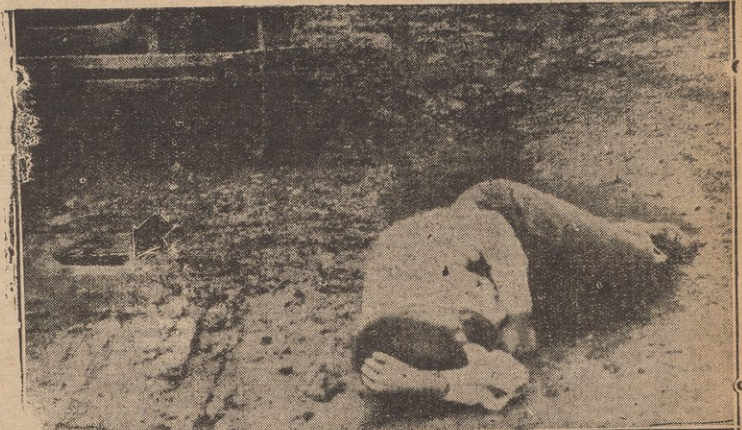
A miner wounded by bullets and shotgun slugs when company gunmen fired into a picket line from ambush at the Wildwood Mine of the Butler Consolidated Co. In front of the auto is a blackjack which one of the thugs threw aside in order to use his gun.