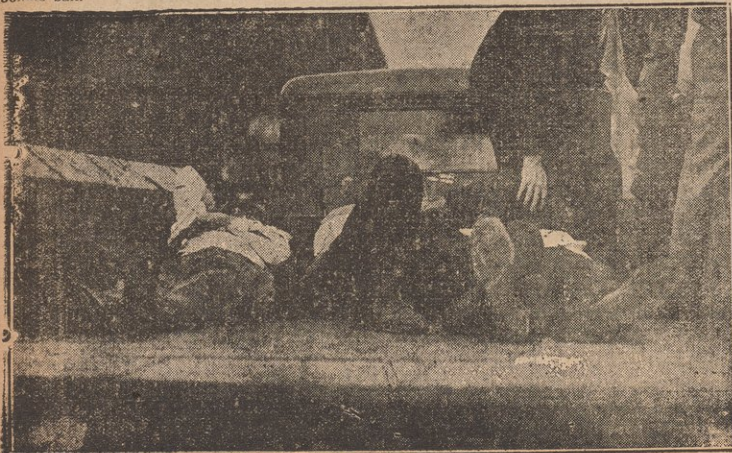
Three of the wounded strikers who were ambushed and shot while picketing the Wildwood mine, are shown lying on a coal truck, being held without any medical attention by the company killers. They were thrown on the steel floor of the truck and shoved about. Before they were picked up they were lying on the roadway for 20 minutes.