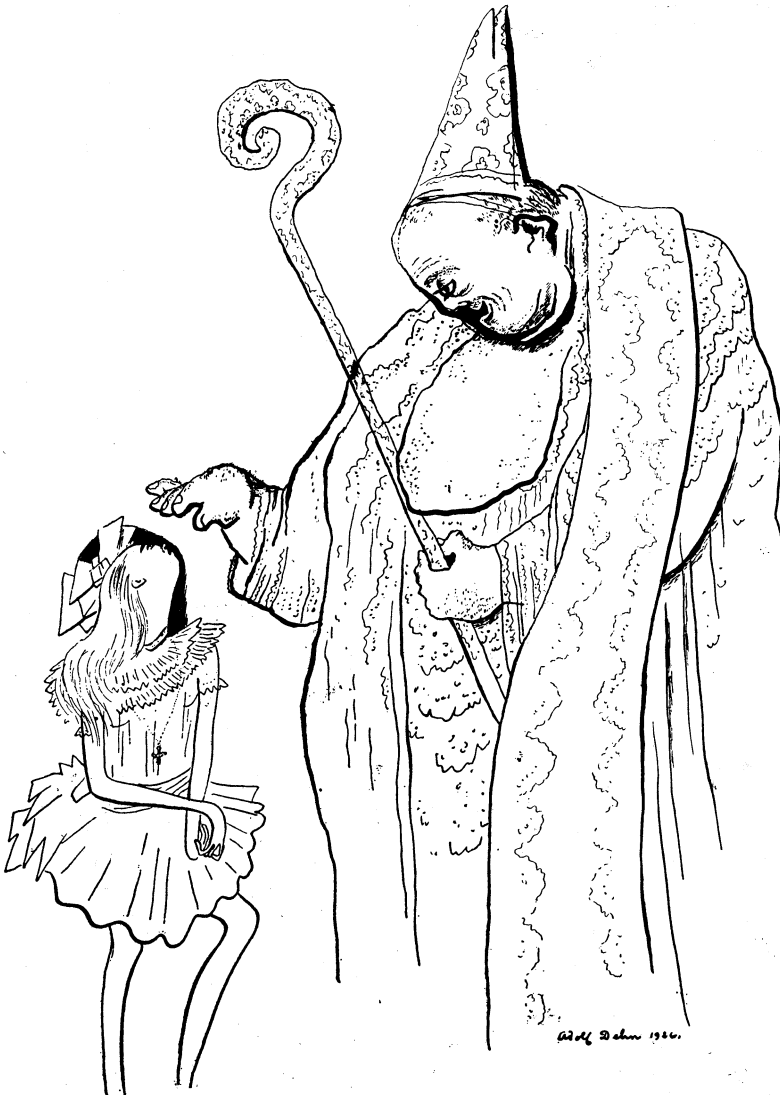
DRAWING BY ADOLF DELU