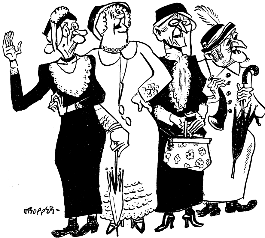
DRAWING BY WILLIAM GROPPER

Our business department alleges that this cooperative enterprise of ours is threatened with success. Nonsense. Our business department makes us nervous. "Success" is the great American bore. And with your help (see our house ad) we'd like to continue as un-American and as interesting as possible.