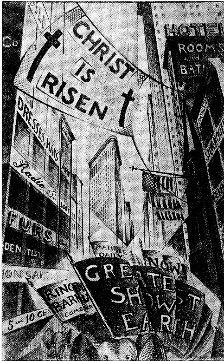
DRAWING BY A. RONNEBECK

Watch the radical press for an announcement of the place and time.