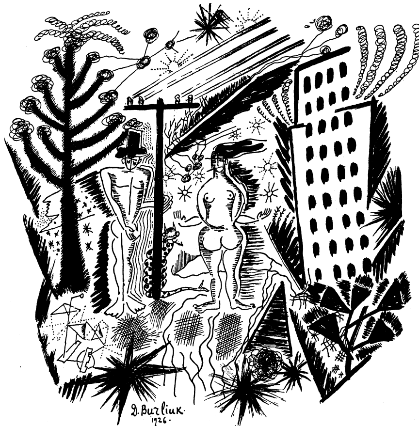
DRAWING BY D. BURLIUK