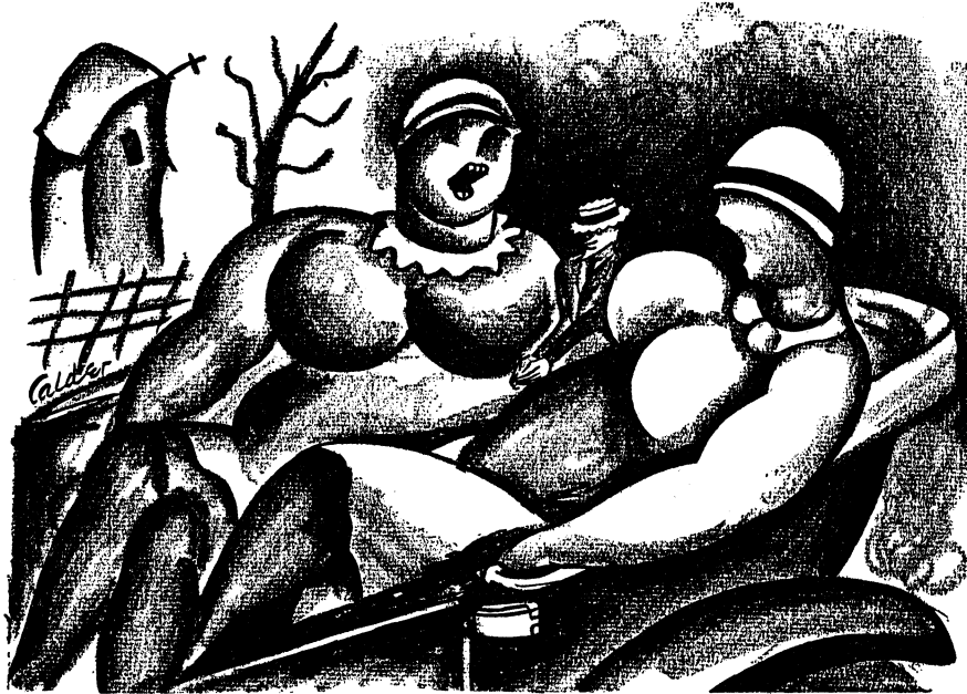
DRAWING BY SANDY CALDER

The May issue, which was barred by the Post Office after it had been mailed third class to our subscribers, sold out on the newsstands within a few days after its appearance. The decision of the department now makes it impossible for us to mail any further copies of the May issue. The June issue went through the mails third class. It has not been declared unmailable. This, the July issue will be reviewed by the Post Office department in connection with renewed application for second class mailing privileges.