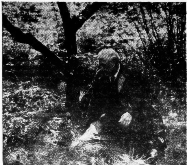
VICTOR SJOSTROM AS PROFESSOR ISAK BORG The doctor visits the strawberry patch of his childhood

IT IS TEMPTING to suggest another intention. The clue to it may be the doctor, who is