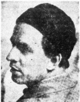
INGMAR BERGMAN Clash of reason and feeling

It is typical of Bergman that his persuasive remarks on the opposite ways in which we respond to the written word and to the image on the screen should precede four exhibits of his own highly developed literary imagination employed in the