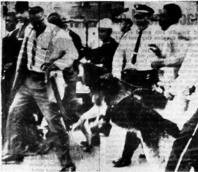
POLICE HELD THEIR DOGS ON SLACKENED LEASHES Younger ones escaped the teeth; the less nimble were bitten, clubbed