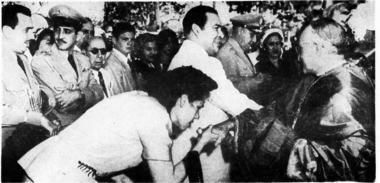
SENORA BATISTA IS SHOWN IN HAPPIER TIMES KISSING THE HAND OF CARDINAL ARTEAGA OF HAVANA Second from the left is Col. Blanco Rico, one of Batista's top cops and chief torturer of Cuba

FEW STOOD UP: Yet the priesthood came through the Batista nightmare not without some credit. Mainly this was due to the heroism of the "With Cross and Fatherland" priests; even one bishop—Villaverde or Matanzas, now dead—re-