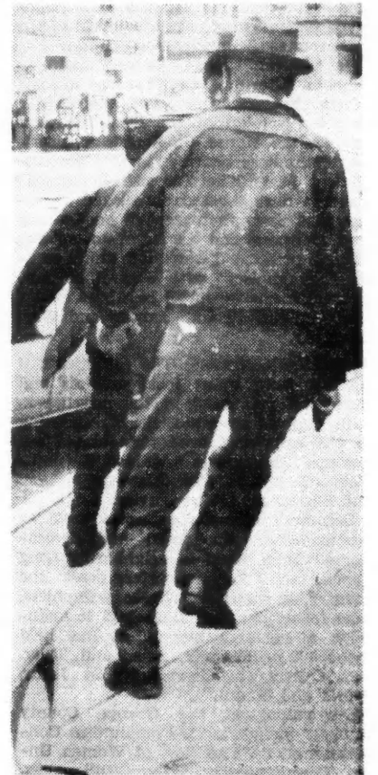
A BYSTANDER WITH A GUN He chased and beat a demonstrator

In March color lines disappeared in Hattiesburg when floods brought five days of destruction. A Negro woman said when it was over: "Whites of all ages came and sweated it out with us. . . I can tell you this, it's something I won't forget."