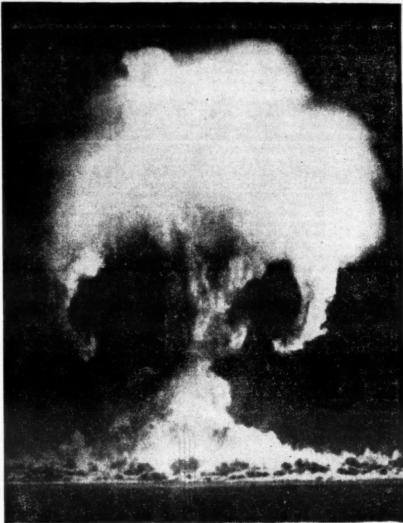
EVERY DAY, IN EVERY WAY, THEY'RE GROWING BIGGER AND BIGGER A recent blast in Nevada made the Hiroshima bomb look like a cap pistol