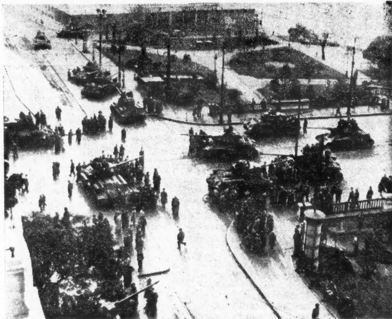
SOVIET TANKS IN BUDAPEST—AFTER THEM THE DEBATE The Soviets saw the revolt as a threat to socialism. Many socialists view the Russian intervention as a setback for socialism.

Aptheker says that fascists and anti-Semites were lynching communists. Fryer says the victims were for the most part