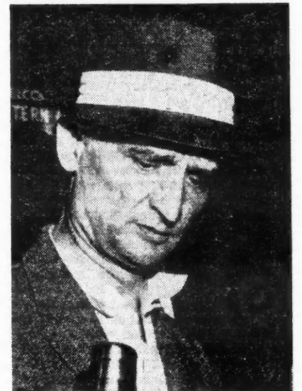
RUDOLF IVANOVICH ABEL Master gadgeteer

Additional information can be obtained from the American Committee for Protection of Foreign Born, 49 E. 21st St., New York 10, N.Y.