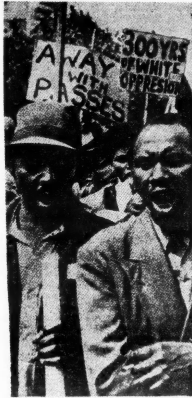
THEY WON'T TAKE MUCH MORE A protest rally in Johannesburg.

This outlawing of inter-racial social contacts is, Paton declared, "like the closing of the last door, the pulling up of the last bridge into the white fortress behind whose battlements the white people of South Africa are sealing themselves off from the rest of the continent and indeed from the rest of the world... If these bridges are destroyed there can be one way only by which the majority of the people can bring about a change