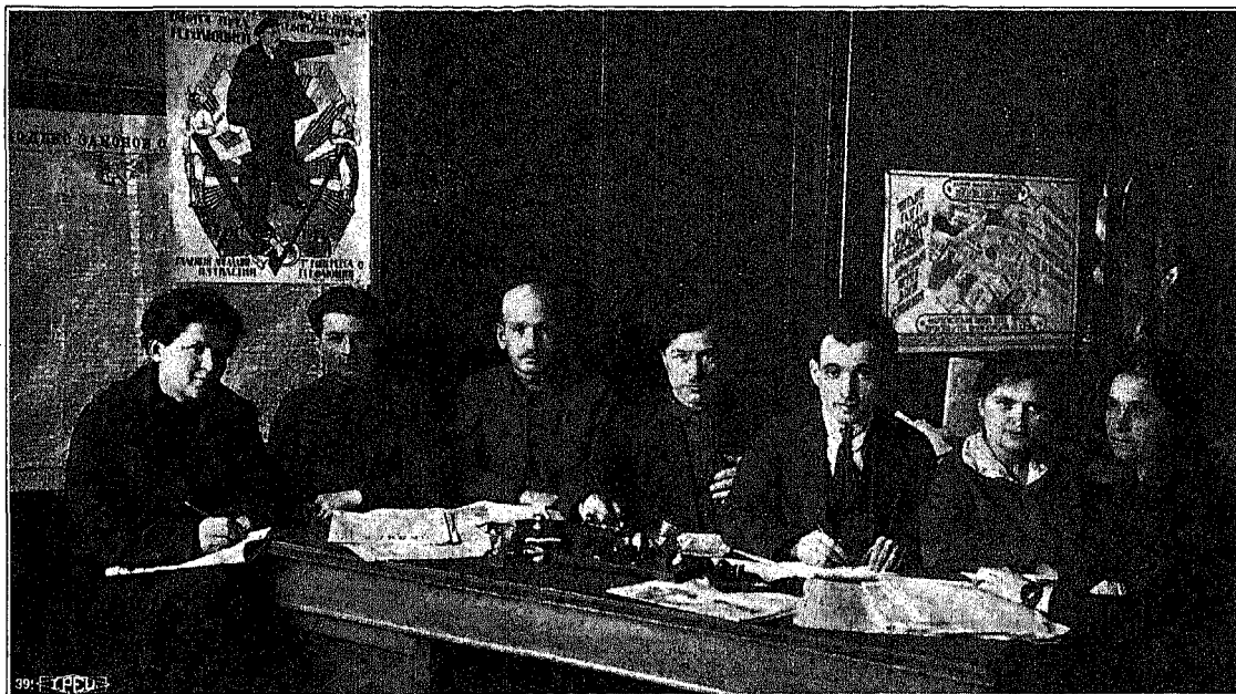
SHOP COMMITTEE EXECUTIVE OF THE MOSCOW EXPERIMENTAL FACTORY

Illustrating, moreover, the demand for better clothes on the part of special sections of the Russian people my informant went on: "Although nearly 90% of the 135,000,000 of present-day Russia are of the land-working class, large sections of this rural population are graduating into comparative civilization. For instance, many of the young peasants finishing their period of training with the Red Army are demanding civilian clothes, something like those they have seen worn in the cities. These young men constitute a sub-