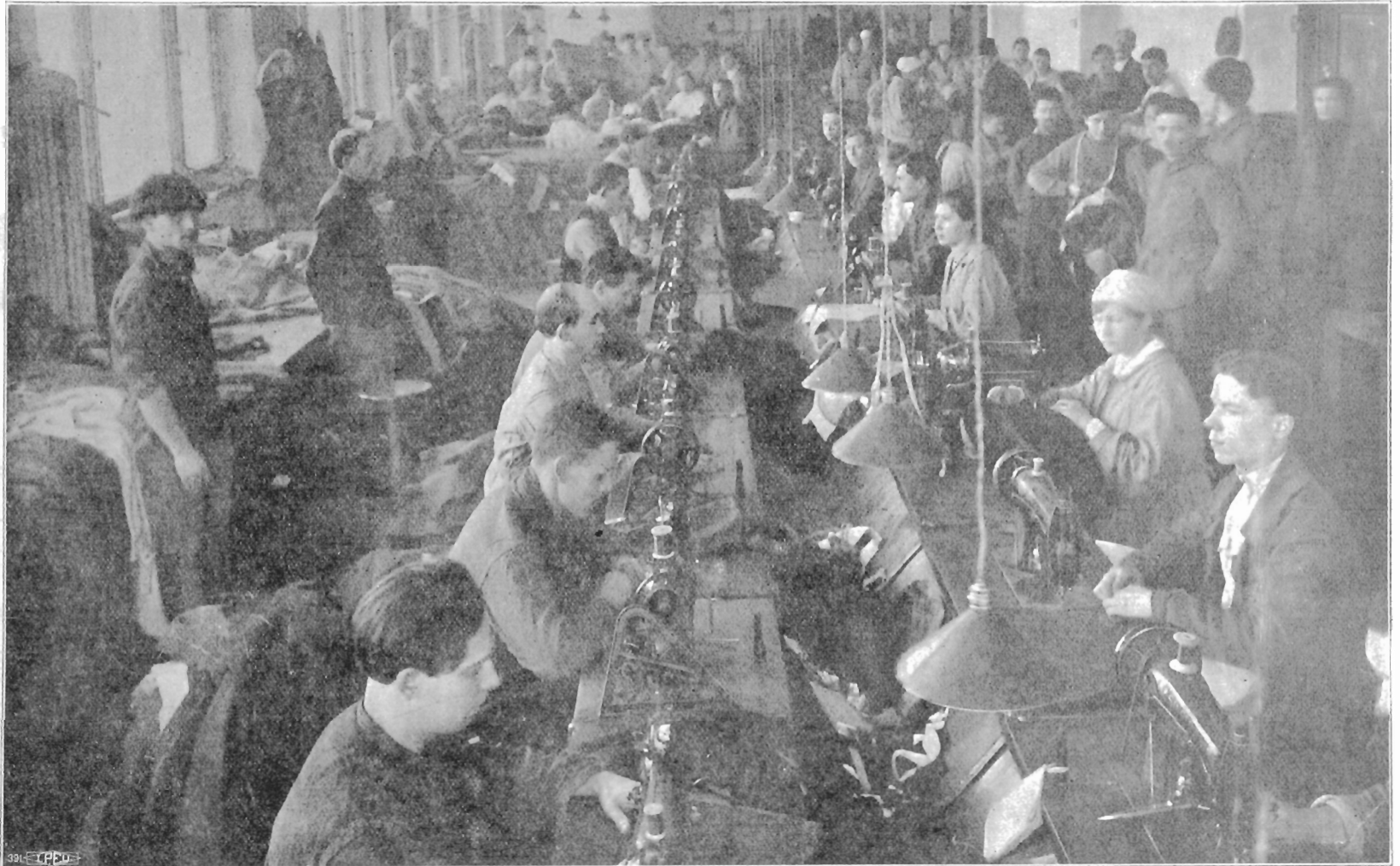
OPERATING DEPARTMENT OF MOSCOW EXPERIMENTAL FACTORY The center of the Garment Factory System of Soviet Russia operated in co-operation with the RAIC