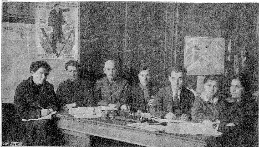
SHOP COMMITTEE EXECUTIVE OF THE MOSCOW EXPERIMENTAL FACTORY