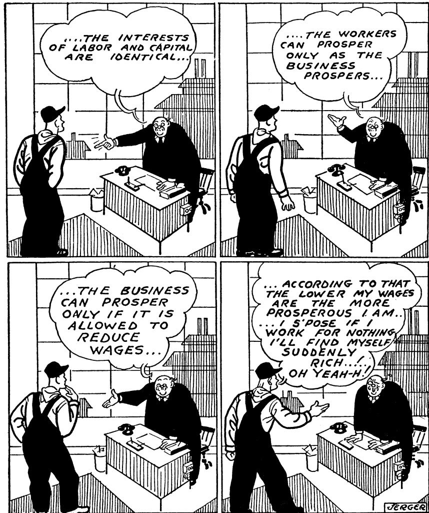
(From Locomotive Engineer's Journal)

limitation of hours of labor with no corresponding reduction of pay because of such limitation.