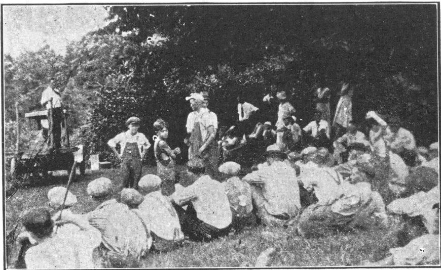
Larry Hogan Holding Secret Meeting in Woods