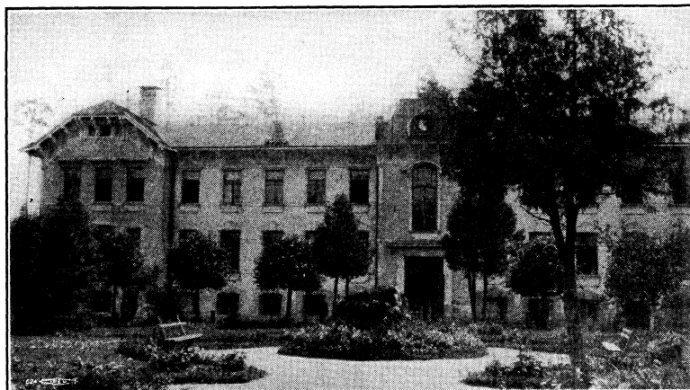
Where homeless children are taught according to "The New Education," and where through committees they run the entire institution, in the suburbs of Moscow.

ends they have in view. The author shows how carefully they have sought to master the best educational thought and techniques, and how they are applying their knowledge on a scale limited only by their financial resources. Only blind optimism or class-conscious fatalism could be the inspiration of this impressive movement so significant to the leaders of education the world over. Russia is the world's economic, political and educational laboratory and her experiments deserve the thoughtful and impartial consideration of the world's best and most progressive educational thinkers.