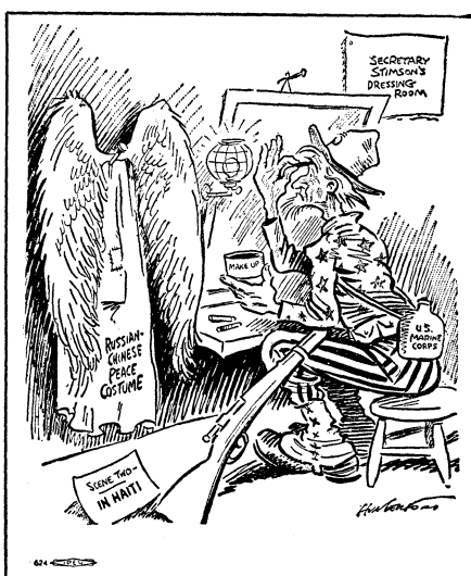
As Hungerford in the Pittsburgh Post-Gazette sees Uncle Sam in peace and war.

more money and the out-of-works will draw a couple of shillings more dole and with less trouble but it remains the same old pest as the economists of all opinions pointed out.