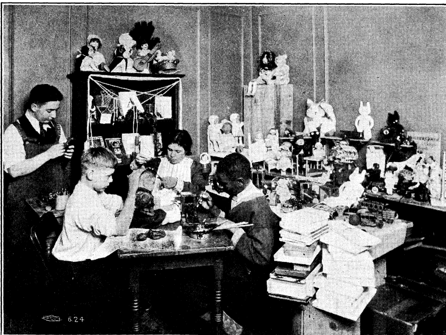
Philadelphia members of Pioneer Youth hard at work making, painting and decorating gifts for Southern strikers' children.