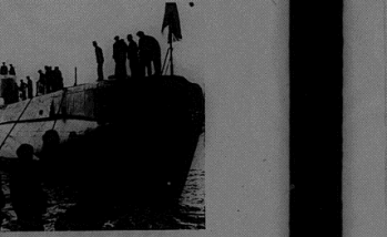
Toronto and Stogger Great Britain teaches member of its great, new type mobocracy at Glasgow. "Shoppers" to see, riding down the wage, after being christened by Lady Tweedie

A United Front of 60 organizations repre-