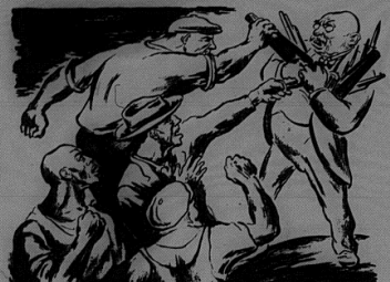
"Why that's the makings of a revolution army. If some radical agitator starts a strike in that trader job, Good Lord! There's no telling what would happen. We'd all have to pack up and get out of here."