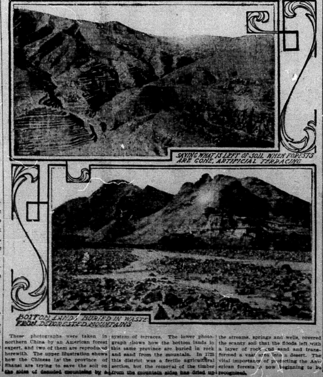
SAVING WHAT IS LEFT OF SOIL WHEN FORESTS ARE GONE, ARTIFICIAL TERRACING