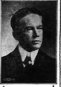
CHARLES EDWARD RUSSELL

On the other 32 pages A. M. Simons presents each week articles and fiction by some of the best authors in the Socialist movement.