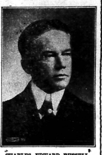
CHARLES EDWARD RUSSELL