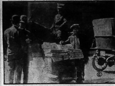
HOW CHICAGO POLICE GUARD SCAB NEWS STANDS