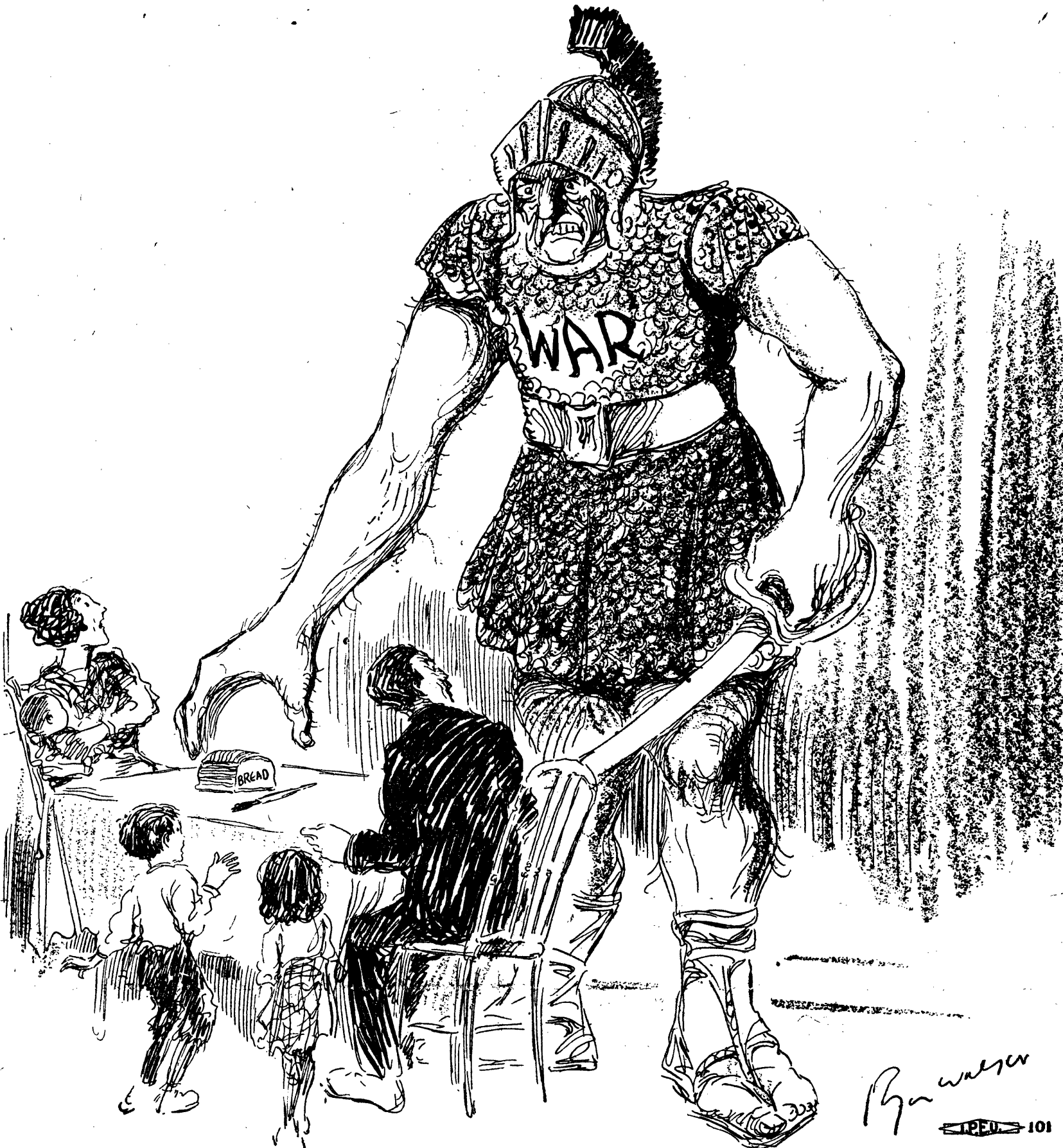
The Last Loaf Of Bread—Your Contribution To Wall Street's War.

One of the big arguments used against entering the war was that it threatened the republic. The representatives of the people of the United States have no such scruples. Why worry about the republic as long as the dollars of Wall Street receive protection?