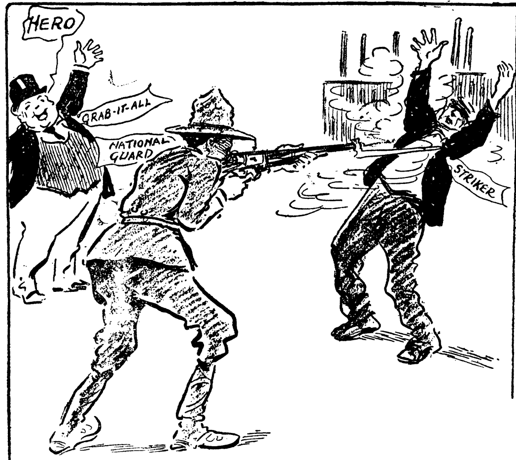
The National Guard In Times of Peace.