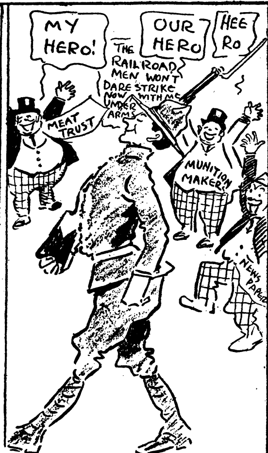
Going To The Mexican Border.