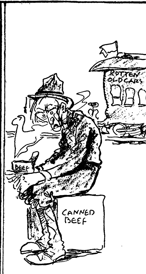
Rides In Rotten Cars And Gets Ancient Food About Every 36 Hours