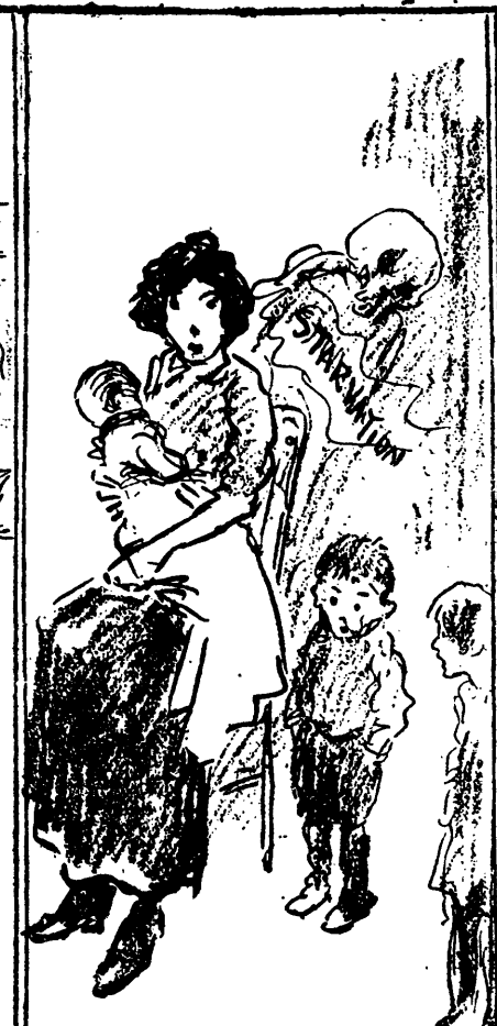
Starvation At Home.