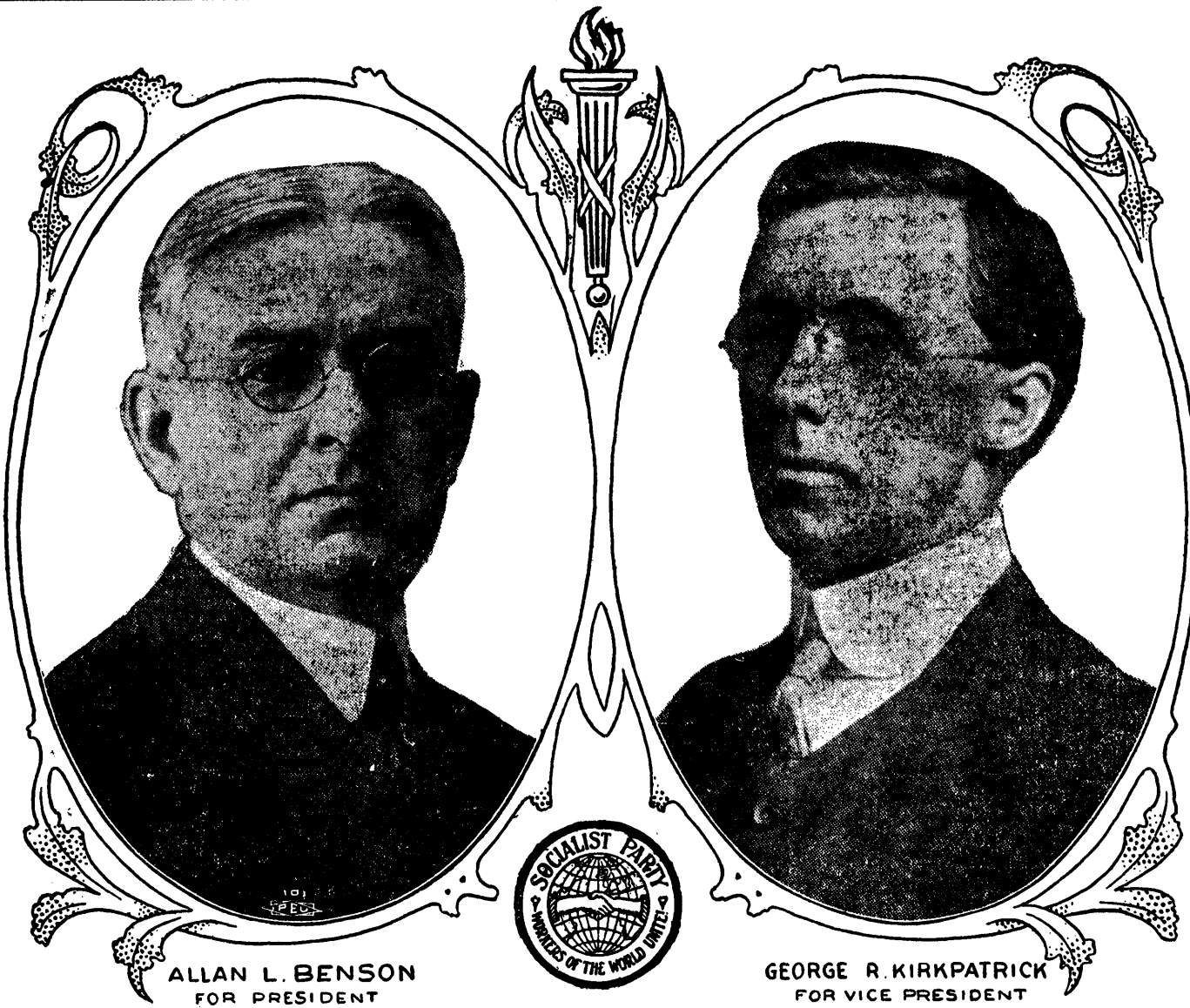
ALLAN L. BENSON FOR PRESIDENT

There is a limited number of dates for which our national standard bearers are available. The time is very short, and live-wires in wide-awake locals desiring to secure either or both candidates should read the terms below carefully and file application at once.