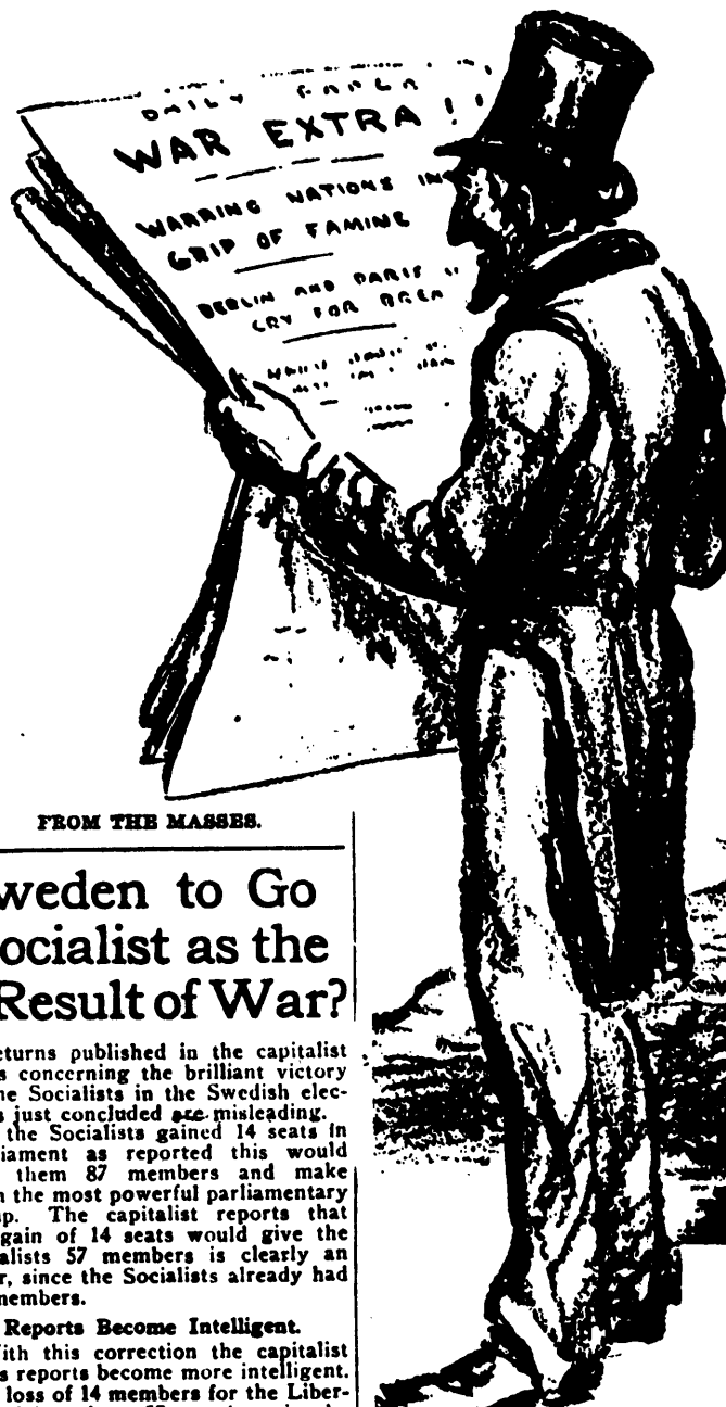
FROM THE MASSES.