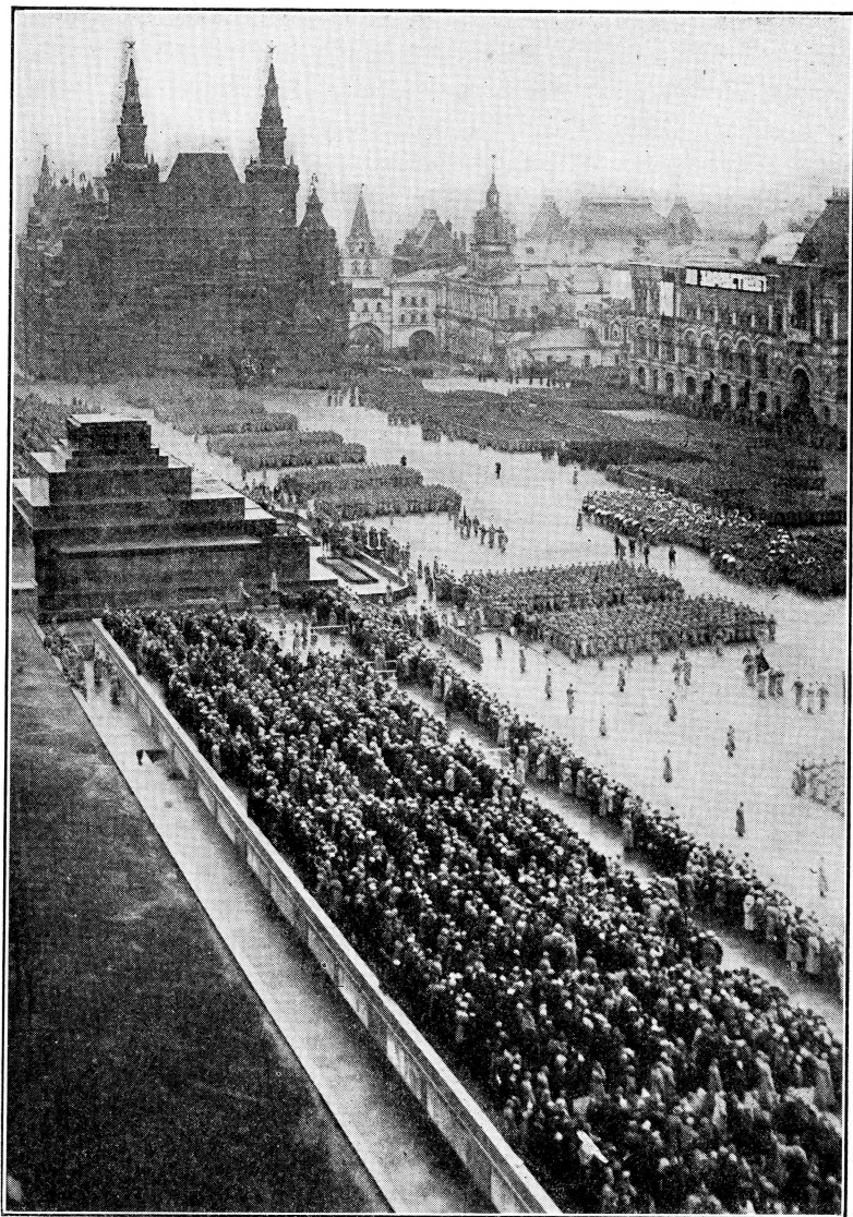
THE RED ARMY AND MOSCOW WORKERS CELEBRATE MAY DAY ON RED SQUARE WITH MEMBERS OF THE GOVERNMENT AND DELEGATES FROM WORKERS' ORGANIZATIONS OF MANY LANDS REVIEWING THE PARADE