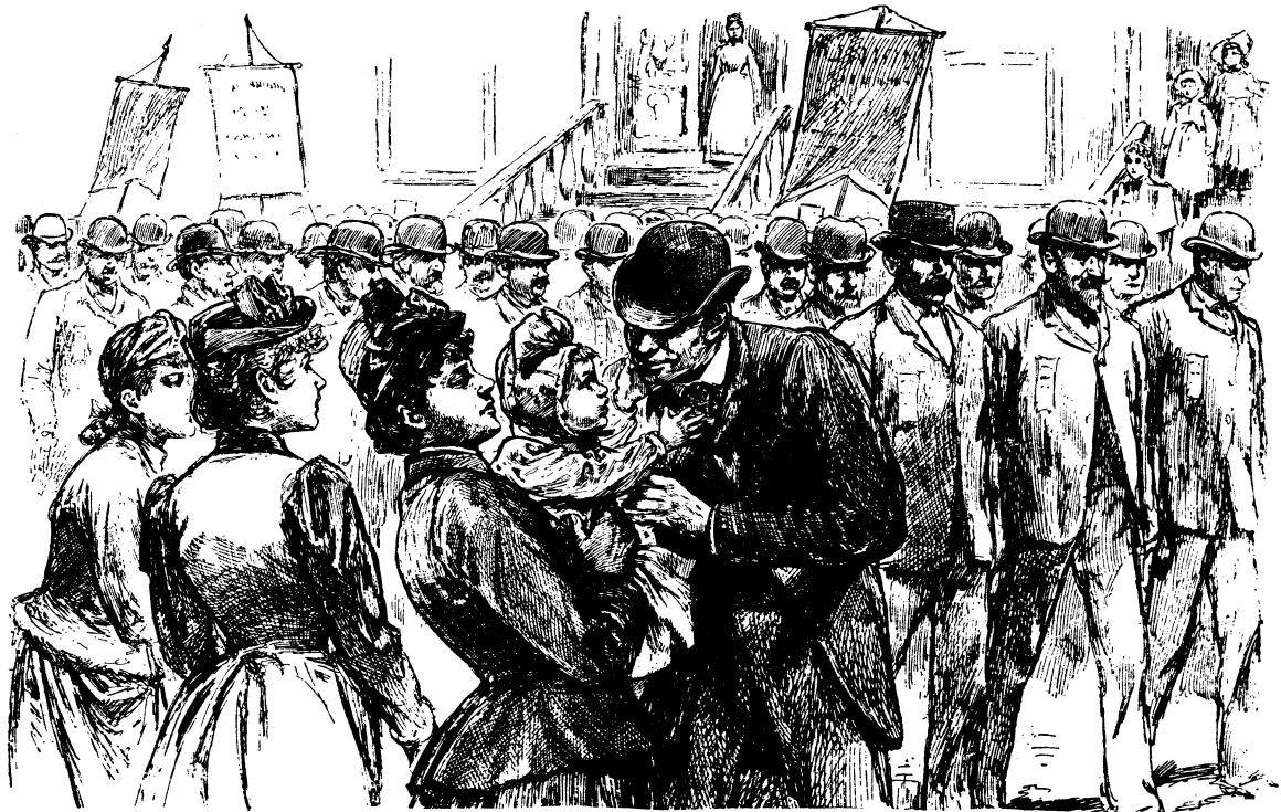
CHICAGO WORKERS PARADE ON THE FIRST INTERNATIONAL MAY DAY, 1890