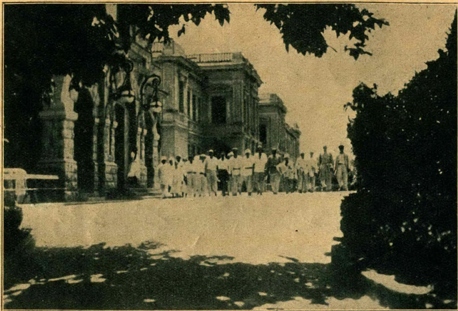
The rest home of the former Czar of Russia (Lividia) turned into a Rest Home for Workers.