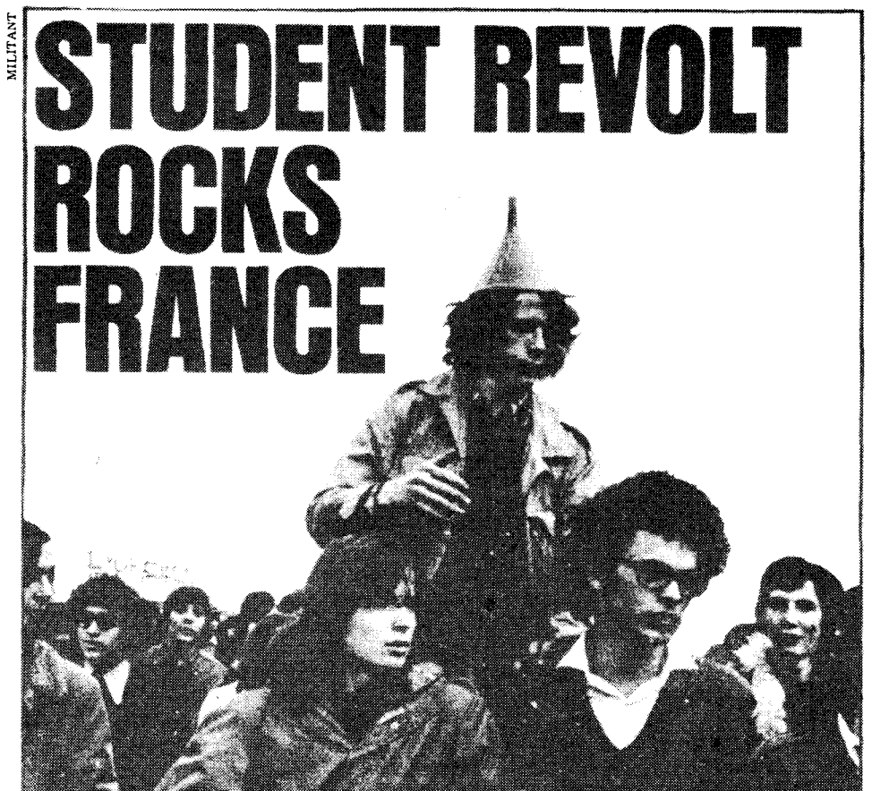
In French student strikes of last Spring, Ligue Communiste's approach was indistinguishable from youth and student vanguardism typical of SWP/YSA. YSA enthused indiscriminately over all student actions (e.g., above), happily reporting Ligue statements about lessons workers were learning from students!

We requested that the trial be postponed so that we might seek to prepare an adequate defense. Certainly the E.C. used as much time to investigate and prepare the charges as they needed, but our requests for extensions were refused. It is interesting to note that the E.C. never denied that we would be unable to prepare an adequate defense, but instead made statements concerning