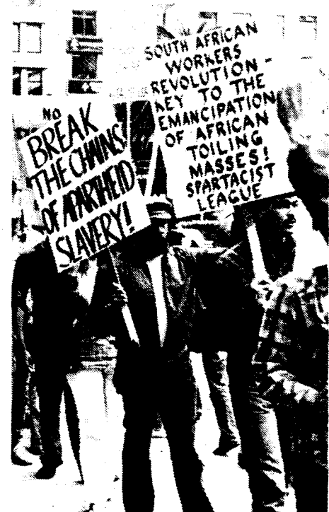
SL/SYL contingent at June 8 NYC demonstration.

initiated Labor/Black Mobilization—which drove the white-sheeted terrorists back into their holes. More recently, in the wake of the apartheid South African government's execution of anti-apartheid fighters, we communists organized emergency protest demonstrations demanding "Stop the Hangings!" and "Smash Reagan/Botha's Anti-Soviet War Drive!" (see article this issue). Rather than organize against the very real and pervasive racist terror which flourishes from Pretoria to Washington, the Pan-Africanists indulge in flights of fantasy to an Africa that never was and never will be.