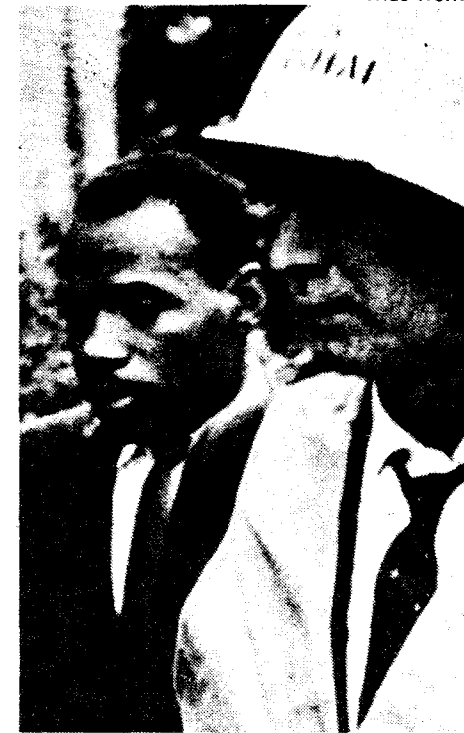
1962: James Meredith, guarded by armed marshal, enrolls at Ole Miss—bastion of segregation.

government nor prayer has substantially changed the reality of black oppression in America. To the anti-racist fighters at Ole Miss we offer the strategy of mass labor/black mobilizations such as the November 27 anti-Klan demonstration which stopped the threatened KKK march in Washington, D.C. We call for a fight to organize the non-union South and defend the right of armed self-defense against racist terror. Black liberation through proletarian revolution! ■