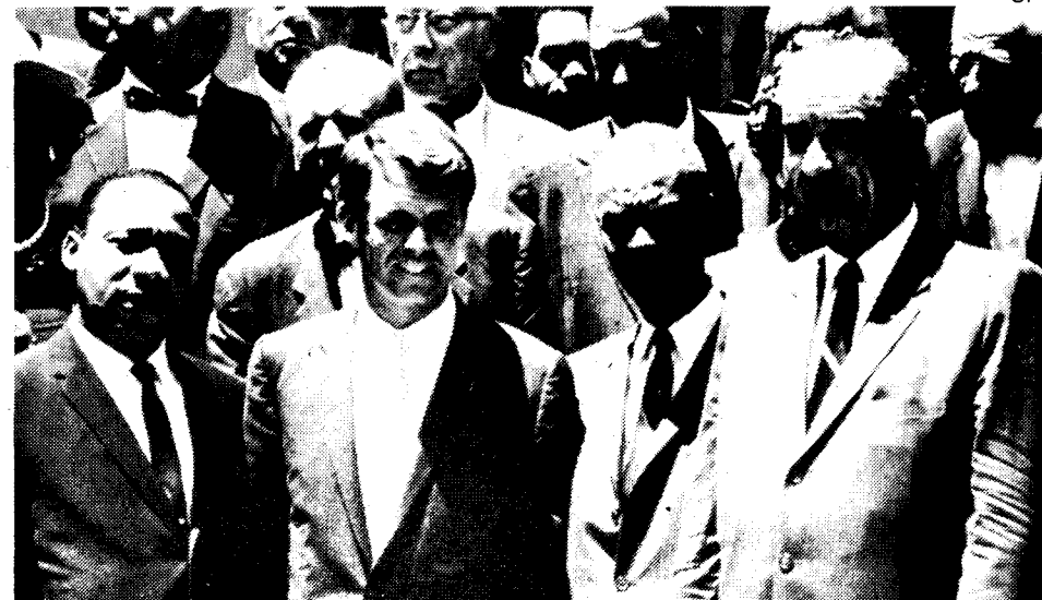
June 1963: M.L. King, Robert Kennedy, Roy Wilkins, Lyndon Johnson. Kennedy authorized FBI surveillance/harassment of King. Dems killed civil rights movement.

When Rosa Parks was arrested in Montgomery, Alabama in 1955 for refusing to give up her seat on a bus to a white man, she sparked a movement which shook the South as it had not been shaken since the days of Reconstruction. For the next decade the struggle against the Jim Crow system—which derived from the counterrevolution against the Civil War and radical