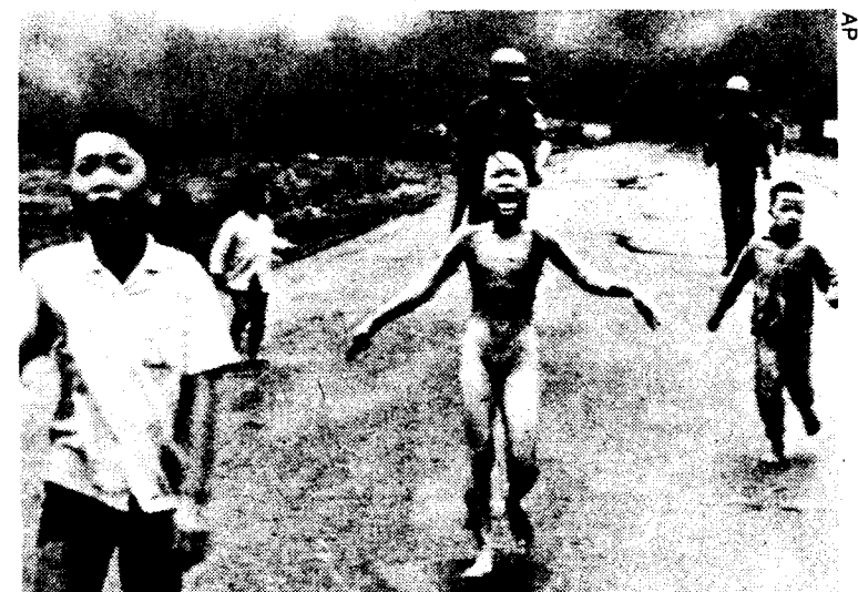
U.S. imperialism rained chemical death on Vietnam. Left: victims of U.S. napalm, 1972.