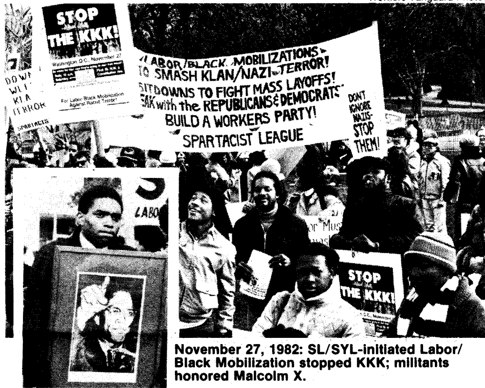
November 27, 1982: SL/SYL-initiated Labor/Black Mobilization stopped KKK; militants honored Malcolm X.