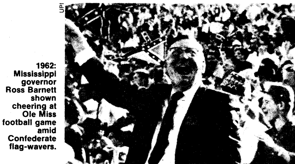
1962: Mississippi governor Ross Barnett shown cheering at Ole Miss football game amid Confederate flag-wavers.

Even the most minimal protests against the despicable symbols of Southern slavery in the deep South are targets for Klan-like intimidation and terror against blacks. The racist U.S. government—whose agents have actively collaborated with the Klan terrorists from Birmingham to Greensboro—