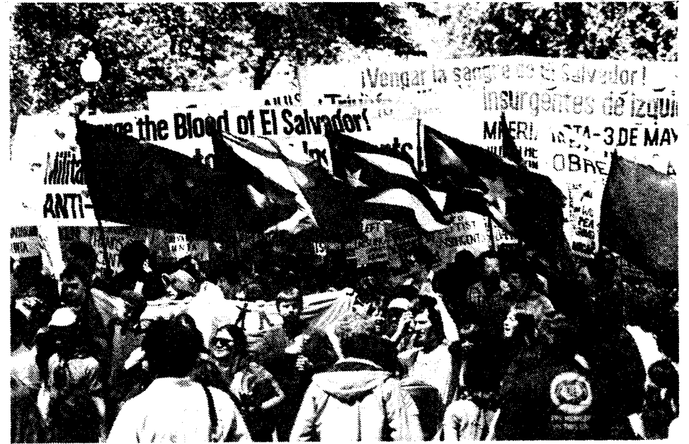
SL/SYL-organized Anti-Imperialist Contingent at May 3, 1981 El Salvador demonstration.

conscriptation is carried out in early morning sweeps of poor and working-class neighborhoods, draft exemptions for the wealthy are easily bought. It is hardly surprising that the desertion rate for the army is over 10 percent and at the first sight of combat many government troops simply lay down their arms and