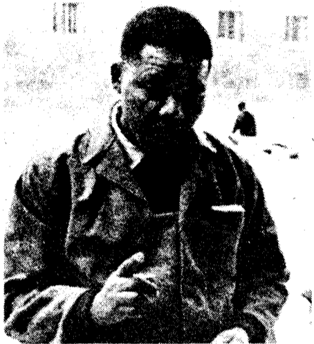
Nelson Mandela in Robben Island prison, 1966, and Winnie Mandela, now under house arrest—historic leaders of anti-racialist fight against apartheid. Free the Mandelas!

In New York City the Spartacist League participated in several rallies. A candlelight vigil which was going to be organized by the Communist Party in New York City was turned into a more militant rally with the introduction of the Spartacist League [slogans] like "Reagan/Begin/Botha: Brothers Under the Skin," Botha being the prime minister of South Africa. In Chicago