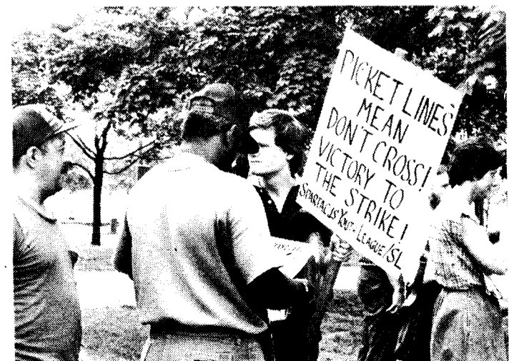
Young Spartacus Photo

food service workers, represented by Local 26 of the International Hotel, Restaurant and Institutional Employees and Bartenders Union struck when their contract expired on June 19, after