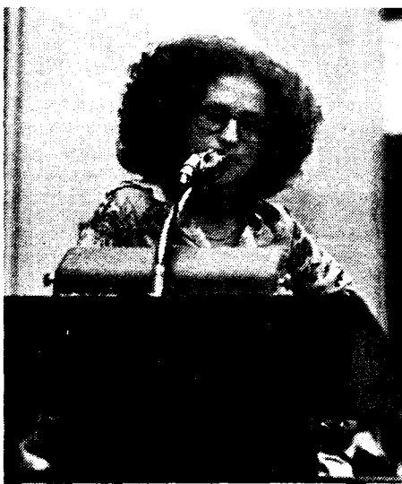
SYL spokesman at Chicago Board of Education meeting last week.

prevent management victimization through “merit” plans, arbitrary transfers, etc. Full integration of the teaching force must be achieved under union control and would naturally follow the integration of student bodies.