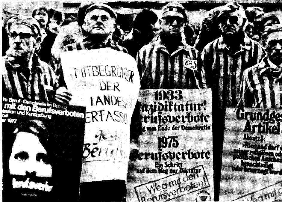
Demonstration against anti-red laws.

The attitude of the Italian government has been to let things blow over. Its demand for Kappler's extradition was aimed solely at dampening the public outcry. Meanwhile, Andreotti's projected meeting with Schmidt was put off until the fall, in order to prevent the “unfortunate incident” from interfering