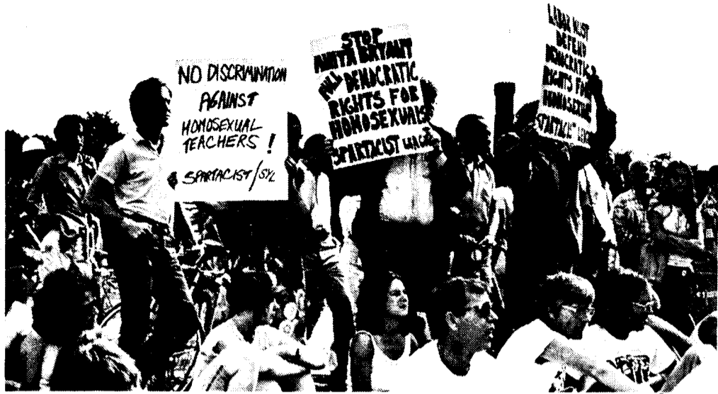
SL/SYL contingent at June 26 rally against Anita Bryant crusade.