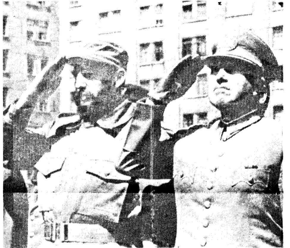
Castro and Pinochet reviewing troops in Santiago during Castro's visit to Chile in November 1971.

While the reformists merely chase after the "good guy" of the moment, the