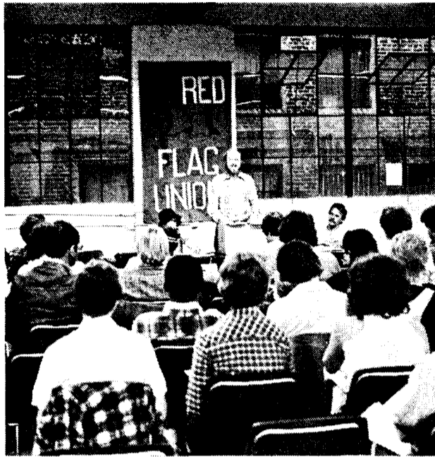
Red Flag Union Stonewall '77 Conference in Los Angeles in early June.

The supporters of the Pabloist IMT have an additional difficulty: their international mentors' penchant for infanticide. The European-based IMT is in bloc with the SWP, which despite its social-democratic appetites still pays lip service to the centrist USec. So Ernest Mandel and his cohorts of the IMT leadership look with disfavor on SWP left critics and others who want to constitute an IMT-loyal grouping in the U.S. Hence the IMT leadership's practice of killing off its centrist American offspring. These latter make sporadic attempts to stop the hemorrhaging of demoralized elements and pull together a pro-IMT "regroupment." These efforts are confounded by the fact that all the groupings are strongly parochial and have major idiosyncratic differences.