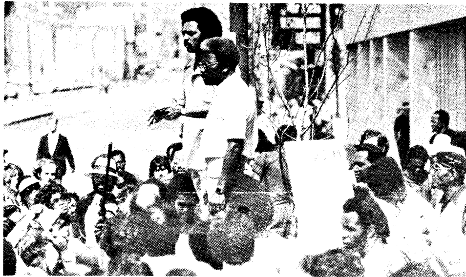
Jesse Jackson speaking at August 27 demonstration in front of Chicago police headquarters.

The CTU correctly regards this as a deliberate attack on the union. The transfers, coming at a time when the union contract is expiring and negotiations between the union and the Board are due to begin, are a clear provocation and an attempt at union-busting.