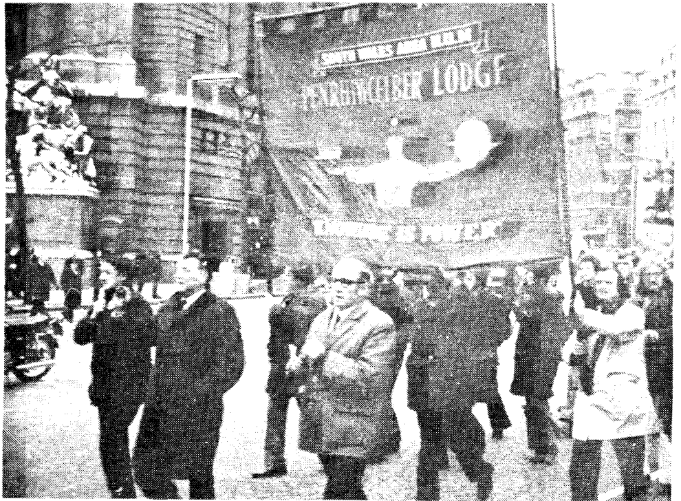
Welsh miners march in Cardiff.

One significant aspect of the elections was the backing off from Heath's hard-line policies toward the miners by significant sections of the British ruling class. The first important breakthrough came on February 21 with the Pay Board's "sudden discovery" that the figures used to weigh the relative wages of the miners were inaccurate and that they were in fact