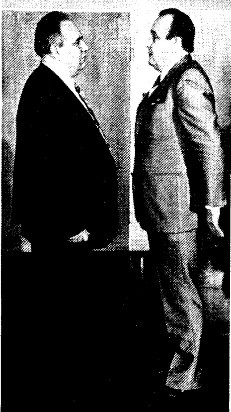
ÖTV's Kluncker (left) and SPD Interior Minister Genscher.

strike. The strike stopped garbage collection from the first day, crippled the postal service on the second and led to shutdowns of power in some areas. However the leadership limited the walkout to only 250,000 workers (one seventh of the total) at the high point and refused to call out workers in so-called "vital services"—hospitals, power stations (in most areas), railroads, etc. Then on the third day the union tops agreed to a "realistic" 11 percent wage increase (with 170 DM minimum) and fringe benefits raising the total package to around 13 percent. To ensure the absence of effective opposition, the contract vote was postponed to more than a week after everyone had gone back to work.