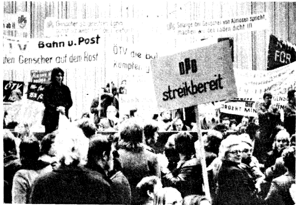
Government workers' demonstration in Dortmund.

The Brandt government was careful to aid the Social Democratic union bureaucracy by appearing to give way only gradually, one-half percent a day, thereby enabling Kluncker to reject several offers so the ranks could blow off steam in a carefully controlled