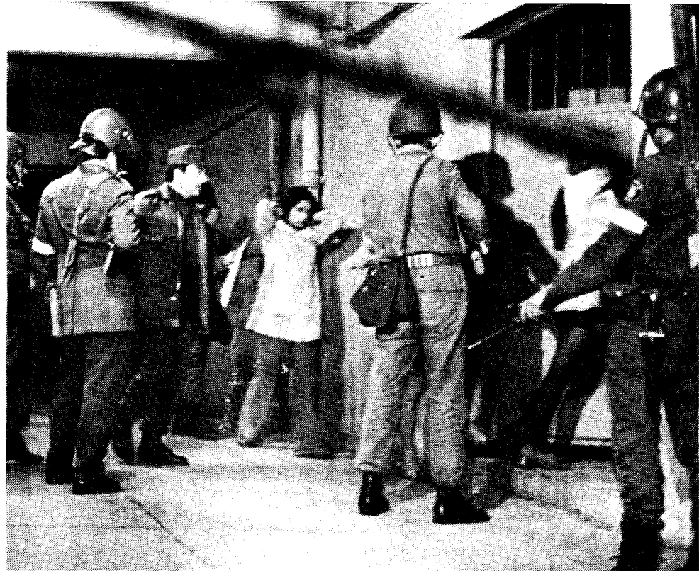
Inside the National Stadium following military coup last September.

At the same time there are now rumors of a deal being worked out to free a few prominent supporters of the Allende government through the intermediary of the United Nations. A New York Times dispatch (2 March) reports that the UN Commission on Human Rights had called on the junta to release five leading leftist prisoners, including Communist Party head Luis Corvalán. "A tacit understanding of the parties [Chile and the USSR] to the deal was that Chile would allow the imprisoned men to leave," the paper reported. We must vigorously demand the immediate release of all the political prisoners who are victims of the reactionary junta's repression, including Corvalán or even "constitutionalist" officers. However, such a special deal would put the lives of far-left militants such as Romero and Van Schouwen in immediate danger.