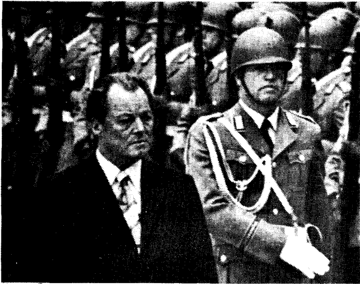
West German Chancellor Willy Brandt