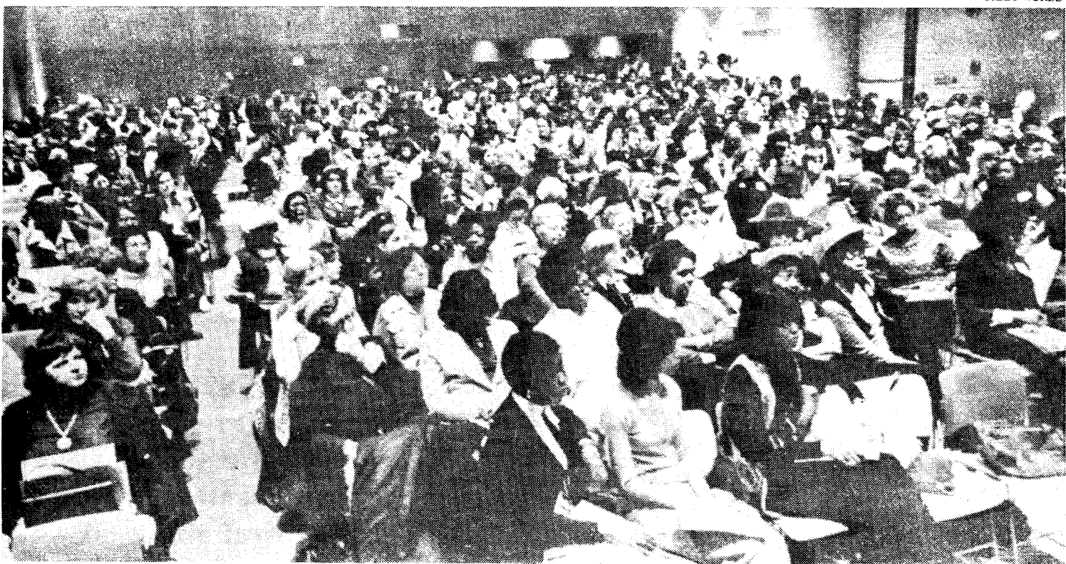
January 19 New York Trade Union Women's Conference.