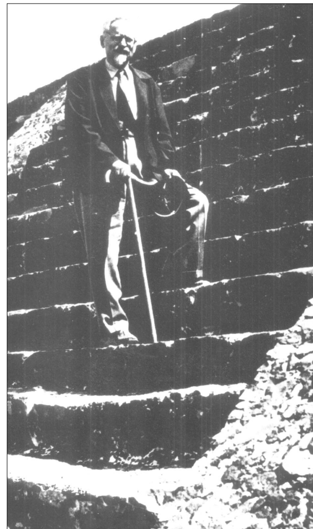
Trotsky in Teotihuacán, near Mexico City