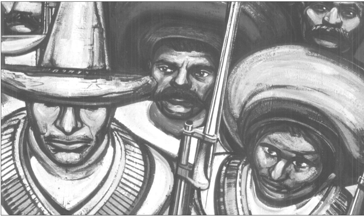
A stylised picture of "the Mexican revolution" — without class definition — by David Siqueiros, the Stalinist painter who tried to murder Trotsky