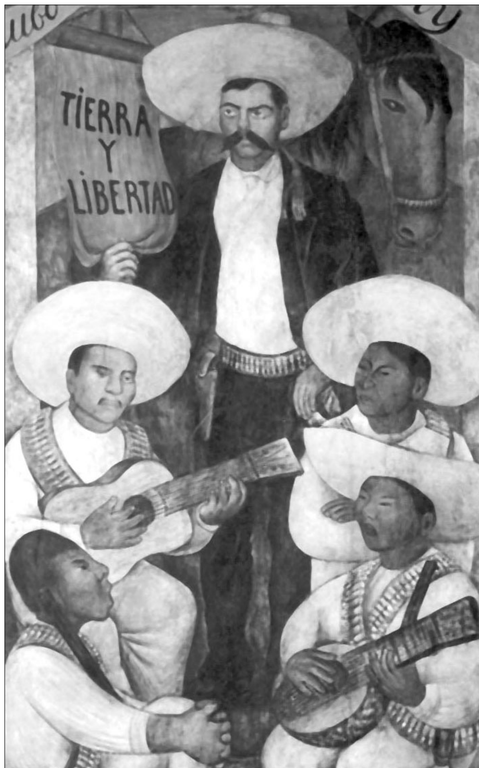
The Mexican revolution: detail from a mural by Diego Rivera

In March 1929 Calles formed the National