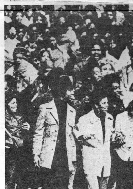
Building a labor party is key to Black struggle in the US.

course of the class struggle in a certain way. We agree that voting by itself will not change which class rules, but voting for working class candidates will change the direction of the working class toward class independence, toward a Labor Party. The real reason the SWP, Socialist Action, the Internationalist Workers Party, the Revolutionary Workers League are saying the elections are only "business as usual" and playing down a fight for a Labor Party in the elections is because they do not want to lead the fight for a Labor Party after the elections. To lead instead of follow would mean a drastic change of political line and that is why they refused an electoral alliance for a Labor Party. Once the processes are set in motion toward a Labor Party the struggle can only go in one direction — a united and active struggle that looks for every opportunity to build the Labor Party. And that requires leadership.