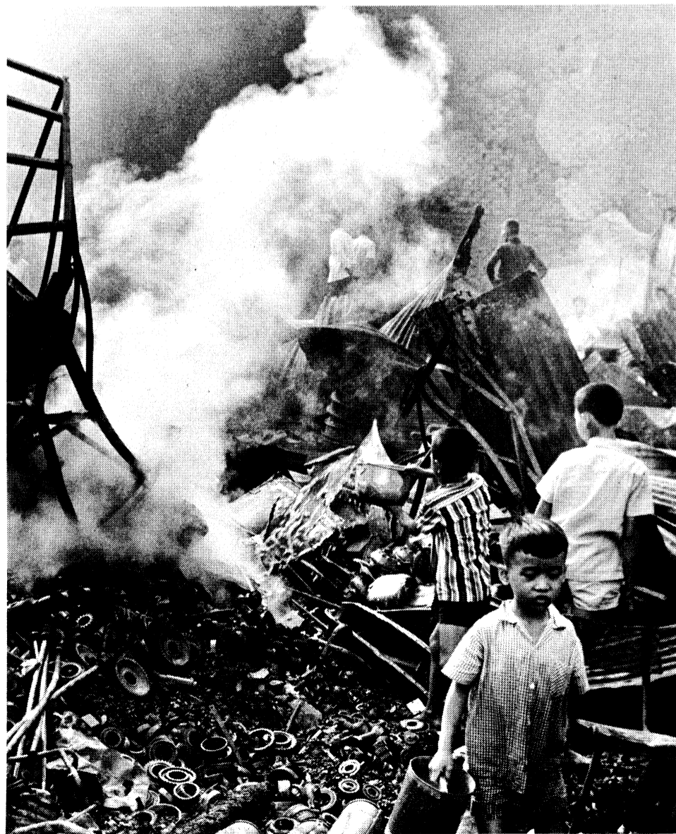
Children's bucket brigade in section of Saigon bombed by U.S. planes, February 1968.

For information and arrangements, contact Committee of Kent State Massacre Witnesses, c/o Cleveland Area Student Mobilization Committee to End the War in Vietnam, 2102 Euclid Ave., Cleveland, Ohio. Tel: (216) 621-6516. Money is urgently needed.