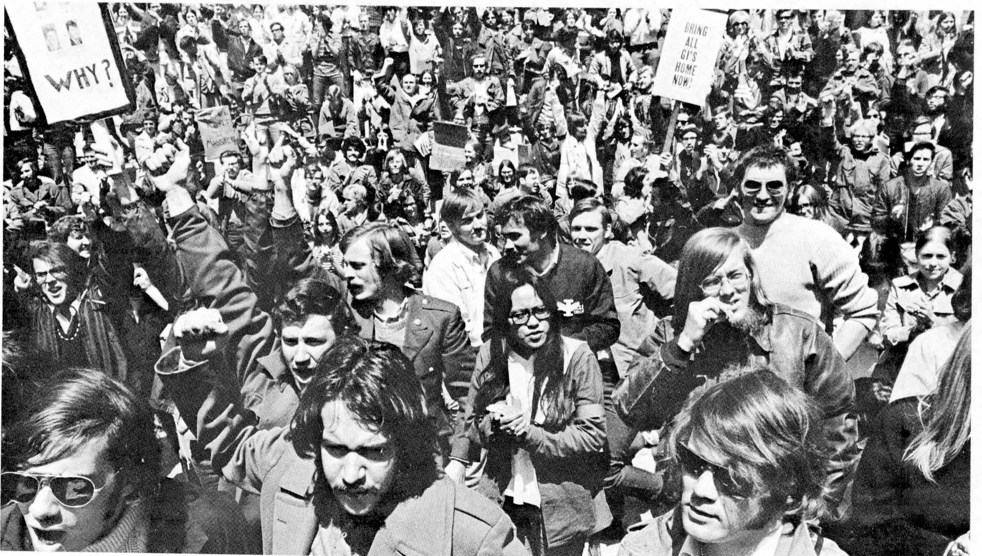
Mass rally at University of Illinois, Chicago

Bring all the GIs home from Indochina NOW!