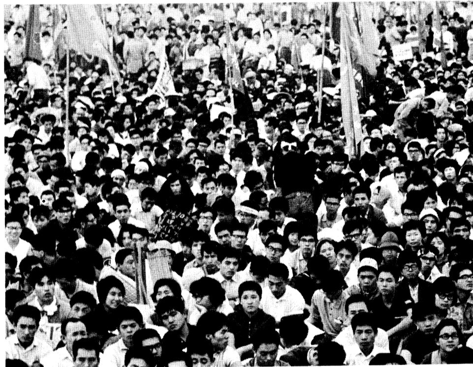
From the beginning of the war, Japan movements have protested U.S. aggression. Here, union demonstrators in Tokyo.