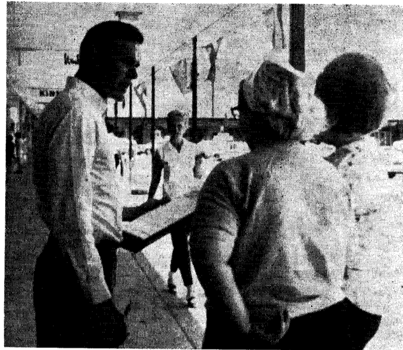
MICHIGAN PETITIONING. Last summer, Michigan SWP supporters gathered 22,000 signatures of registered voters to place SWP candidates on ballot.

Pennsylvania is only one of 26 states where the Socialist Workers Party is attempting to get on the ballot in 1968. Over 20,000 signatures were collected in Michigan last summer to meet the official requirements in that state. In addition, the SWP is attempting to get on the ballot in Maine, New