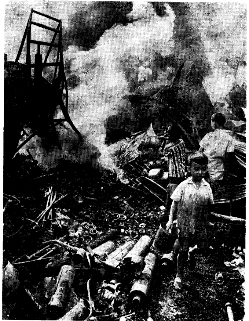
CHILD FIRE BRIGADE. Picture taken in section of Saigon bombed by U.S. and puppet regime.