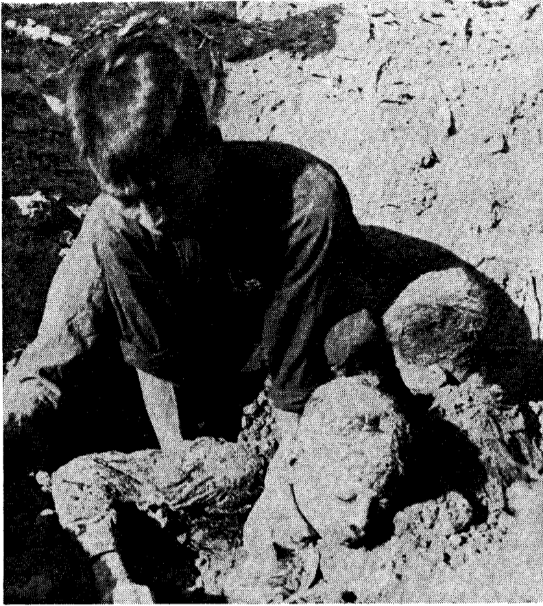
VICTIMS OF U.S. BOMBING. North Vietnamese schoolchild being dug out after bombing. "Third camp" places "equal blame" for war on both Vietnamese and Washington invaders.