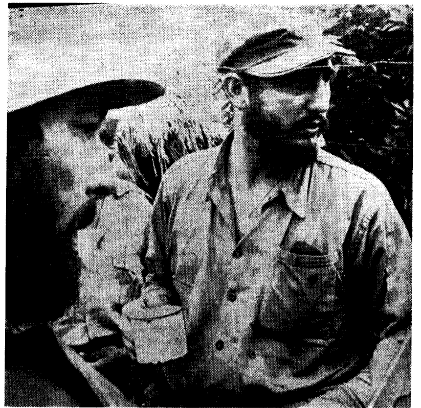
FIDEL CASTRO. During guerrilla war.

In 1958, especially in the province of Oriente, the Revolution