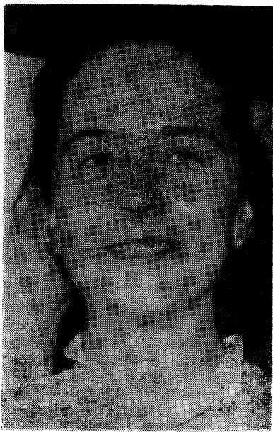
VILMA ESPIN, president of Federation of Cuban Women.

It was not possible, of course, to eradicate this evil from our country in one day. But we can say with pride and with satisfaction that just as the Revolution has eradicated other vices, such as gambling, for example, just as the Revolution has rid the country of beggars, just as there are no longer poverty-stricken children roaming the streets (and there is no capitalist society in which there are no beggars, homeless children, brothels, gambling, vice and corruption of all kinds), the Revolution has also eradicated