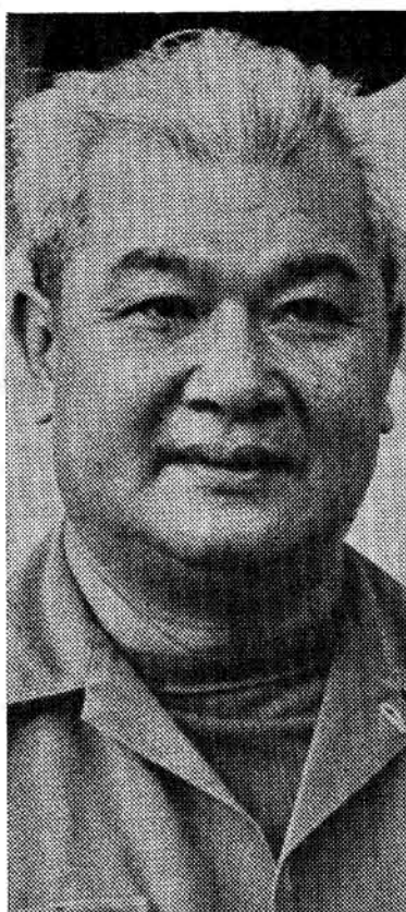
PRINCE BOUN OUM. Corrupt playboy aristocrat was government figurehead for Laotian rightists before 1962 Geneva accords. He is a close associate of right-wing leader, General Phoumi Nosavan.

There are two lost generations — the younger and the older — in America today. The SWP demands for the youth the right to a place in the sun, not in an imperialist army fighting colonial peoples. Older people have their right to that sunlight, too. It is not only the 18 million retired people who