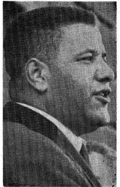
Stanley Branche Chester Civil Rights Leader

It was a big garage. Police cars were parked all around. Police were standing, looking rather foolish with their feet spread apart, holding their sticks, as though looking for more business.