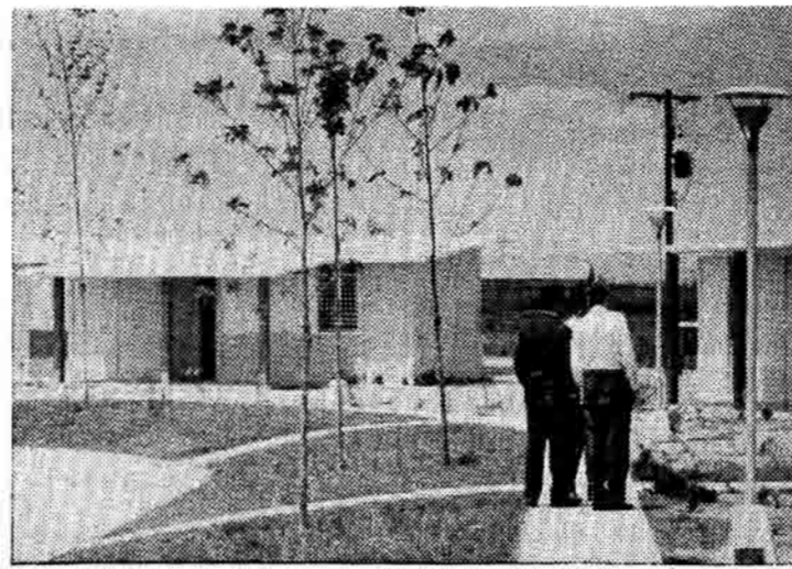
At the Hermanos Sainz cooperative in Pinar del Rio province in Cuba. Low-cost homes like these are beginning to replace the primitive palm-thatched bohios (huts) throughout the island as construction gets under way following the revolution. Among the visitors in the photograph above is Farrell Dobbs, presidential candidate of the Socialist Workers party.

The project when I saw it was a fascinating example of organization. Simultaneously, the following processes were un-