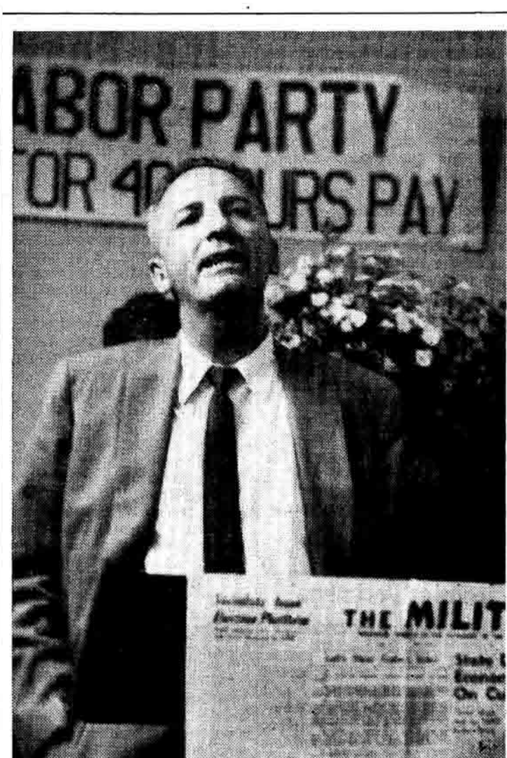
Socialist Workers presidential candidate Farrell Dobbs addressing a July 26 election rally in Philadelphia. A former official of the Teamsters Union, Dobbs was a leader of the militant truck drivers strikes in Minneapolis in the 1930's which transformed that city from a haven of the open shop into a union town. He then led the Northwestern organizing drive that won the first over-the-road contract for the Teamsters.

I am one of the millions of people in this country trying to