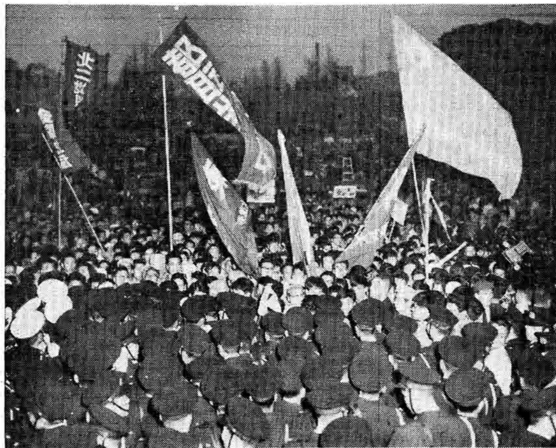
Some ten thousand Japanese workers and students stormed through police lines in Tokyo Nov. 27 to demonstrate before parliament their opposition to the new Japan-U.S. "Security" Pact to be signed in Washington this month. According to story printed below, a group of students expelled from the Communist party for "Trotskyism" led the demonstration.