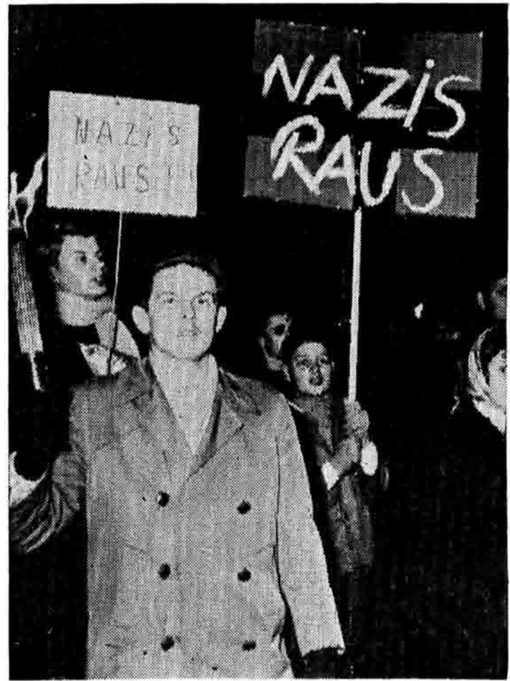
"Nazis Raus" — "Nazis Get Out" — was the reply of 40,000 West Berlin youth to the vandals who smeared swastikas "Jude Raus" ("Jews Get Out") on synagogues and other Jewish buildings. The young people marched in a giant demonstration Jan. 8 called by the Socialist Falcons, Social-Democratic youth organization.