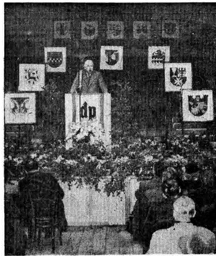
This meeting, with all the familiar Nazi trappings, was held in West Berlin in 1954. Veterans of Hitler's SS (Elite Guard) were cheered wildly. Two students mistaken for Jews were beaten when they refused to stand for the singing of Deutschland Ueber Alles. The speaker was Hans Seeborn, Adenauer's Minister of Transport.

young people to the fascist side unless they are won to the socialist alternative.