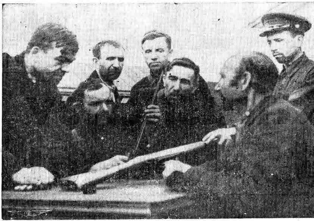
Soviet workers receiving arms during World War II. At the 20th Congress of the Soviet Communist Party in February 1956, Khrushchev admitted that Stalin's policies had been responsible for catastrophic defeats in the first part of the war. The heroic struggle of the Soviet working people wiped out these losses. Again, their sacrifices and hard work after the war resulted in the rapid rebuilding of Soviet industry and in new industrial advances. Now the Soviet working people are pressing the regime for improvements in living standards and for political freedom.