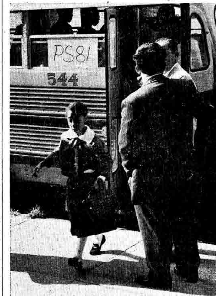
First school bus arrives in Queens with children from Bedford-Stuyvesant area in Brooklyn, where classrooms have been overcrowded.