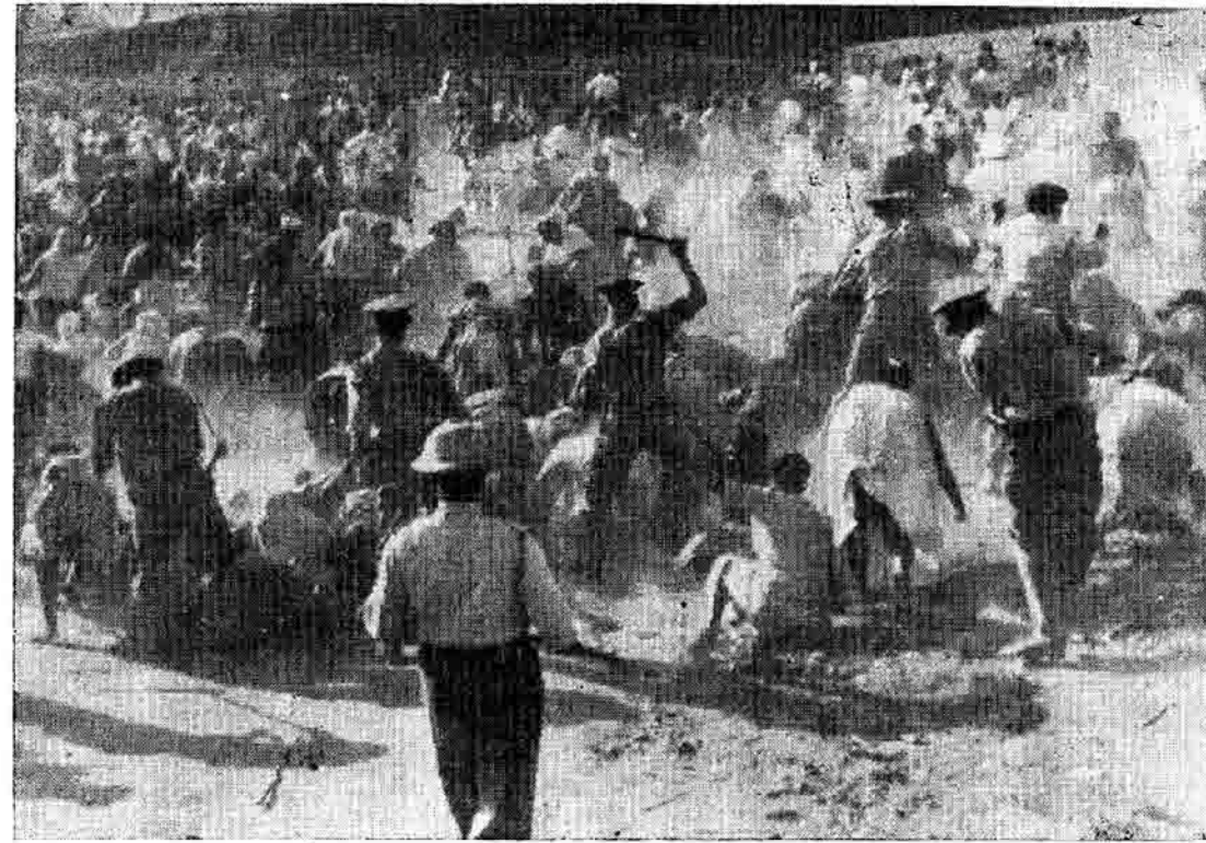
Racist police in Durban, South Africa, swing clubs as they seek to disperse demonstrating African women. The demonstration was touched off when police, in the latest of a long series of brutally oppressive measures, raided home-made stills in the Cato Manor ghetto. The aroused women responded by demonstrating outside municipal beer halls. When the club-wielding police had finished, four persons were dead, many were injured, and property damage was estimated at $700,000.