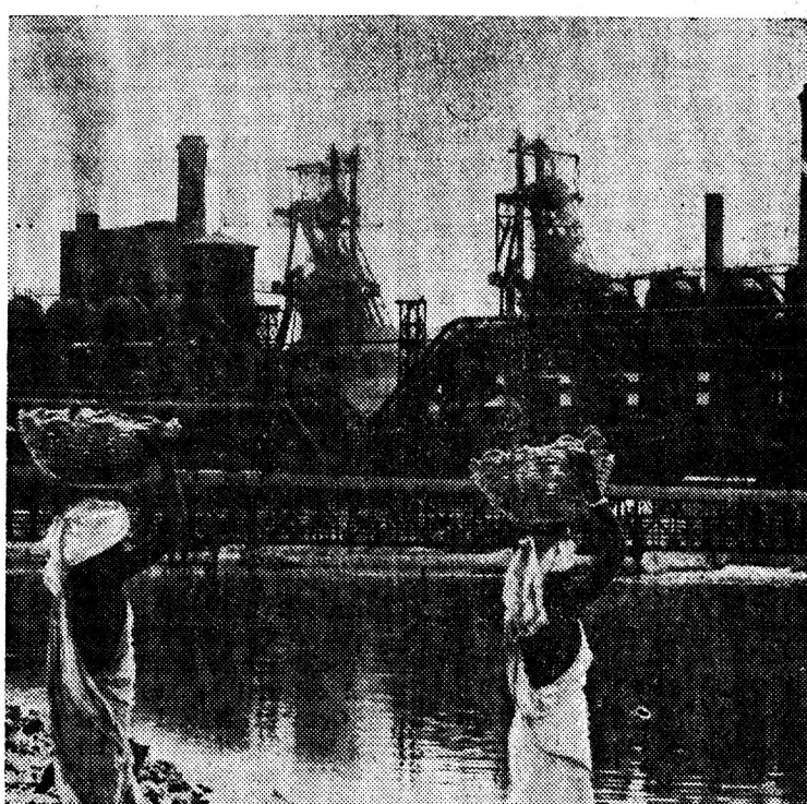
Modern steel plant in India. It barely dents basic agrarian character of India with semi-feudal land relations still prevailing. Eighty per cent of Kerala population lives by agriculture.

This was resented by the student population, with the result that there was not a single school in the state that was not brought into the strike movement. The government was forced to give in. It granted free boat fares to Kuttanad