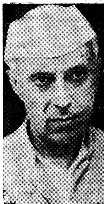
Prime Minister Nehru of India. His Congress Party was replaced by the Communist Party in government of Kerala state.

Officially, the other unions have refused to support the striking drivers. But the bulk of the ranks have clearly indicated their solidarity. Yet, there is more than solidarity involved, although that is fundamental. The members of all the newspaper unions have a stake in this strike and they know it. If the $7 package contract is broken, it will place their unions in a much better bargaining position in their present negotiations. They will have the chance to make greater gains than they could hope for otherwise.