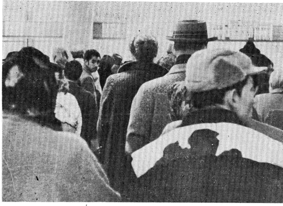
There are still long lines at the New York unemployment offices despite the business upturn. Any reduction in the number drawing unemployment benefits is due, in large part, to the jobless exhausting their benefit right. In September 383,000 ran out of regular or extended unemployment insurance payments.