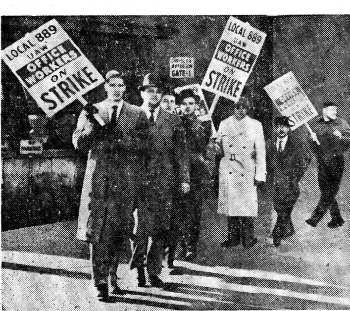
When 8,000 office and engineering employees of Chrysler Corporation went on strike in Detroit, Nov. 13, production workers refused to cross their picket lines. The salaried employees, members of the UAW, settled the strike after five days on the bricks.