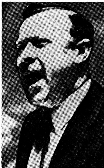
WALTER REUTHER, President of United Auto Workers, which is engaged in fight against ruthless speed-up drive of Chrysler Corporation.

one Dodge worker as follows: "Approximately 8,000 are laid off. The remaining 10,000 are now being subjected to the worst speed-up experience since 1939. On Dec. 20 the whole plant was given a holiday until Jan. 7. Then we worked two and a half days. Seven thousand were given lay-off slips and the rest given another until Jan. 20.