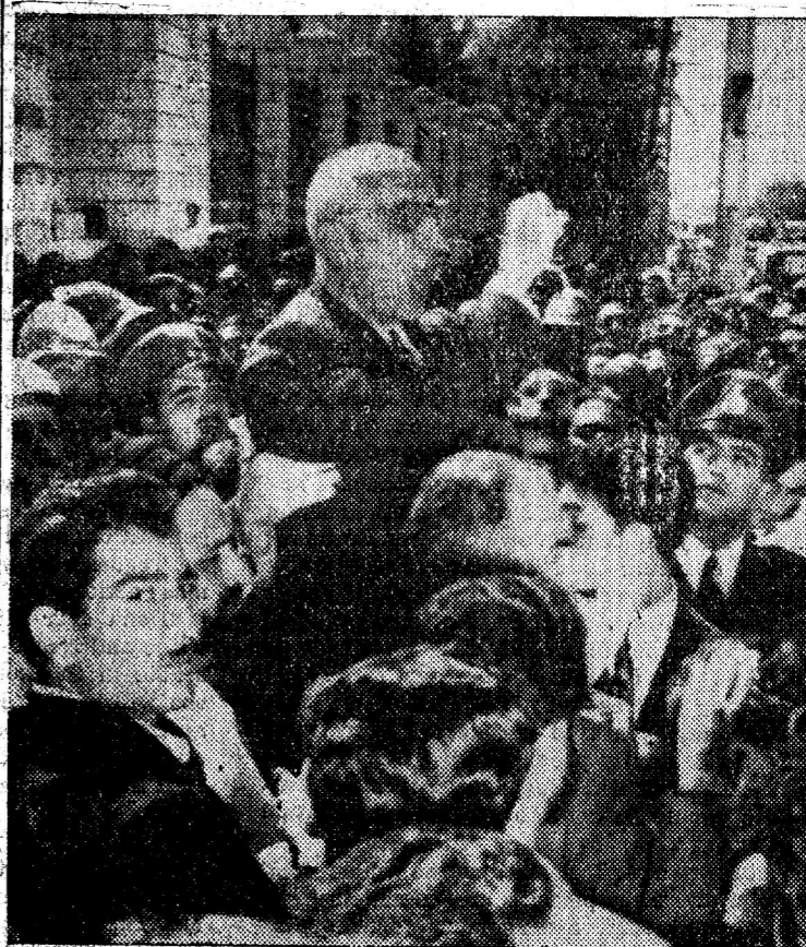
Premier Mohammed Mossadegh addresses a mass demonstration outside Parliament building in Teheran, answering shouts of "Death to the British!" Now Mossadegh is in the U.S. to answer before the UN the British complaints about the Iranian people's audacity in deciding that they had a right to run their country and its resources as they see fit.