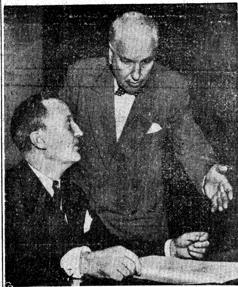
In Washington, Sen. William Benton (D, Conn.) looks over 70 pages of testimony he presented to a Senate subcommittee in support of his resolution to expel Joseph R. McCarthy from the Senate. Guy Gillette (standing) is committee chairman. Growing mass resentment against the witch-hunt has emboldened some Senators to attack McCarthy's methods.