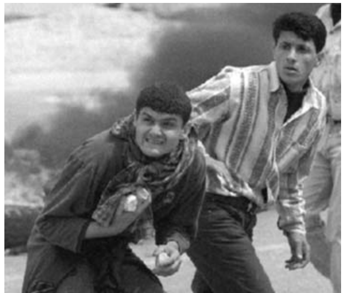
Palestinian youth hurling rocks at Israeli occupiers. Arab rulers failure to arm the Palestinians exposes their loyalty to imperialism.

Moreover, the Spartacists appallingly once raised “a positive demand on a bourgeois state” to send not just arms but an army! In 1983 in Sri Lanka, when the Tamil minority was suffering communalist massacres, the SL called for the army of Sri Lanka’s much larger neighbor India to protect the Sri Lankan Tamils. Their excuse? This would have been “a practical and probably not