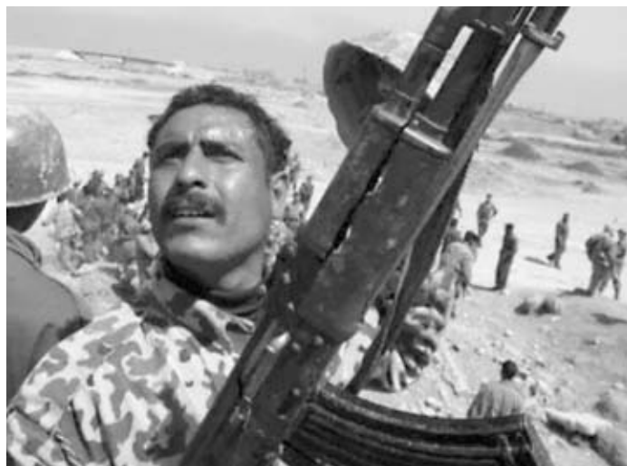
Iraqi Republican Guard outside Baghdad. Iraqi military was outgunned by imperialist war machine.

Another reason for the Bush gang's single-minded war drive is their need to deepen their authority within the U.S. ruling class. This includes electoral victory for their wing of the Republican Party, but it is not that alone. They fear that any temporizing would bolster the "moderates" in their effort to return to the more