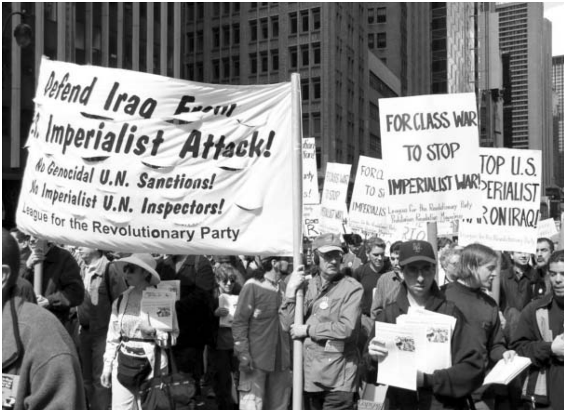
Massive anti-war protest on March 22 in New York. The LRP marched with banner: "Defend Iraq Against U.S. Imperialist Attack! No Genocidal UN Sanctions! No Imperialist UN Inspectors!"

In conclusion, it must be said that for the American comrades of the LRP, who have fought for decades against the stream of political opportunism that has swamped the left, joining forces with a large group of young revolutionary workers from the former Soviet Union, the land of the Russian Revolution, is an inspiring step. It confirms our confidence in the correctness of our struggle. Huge events have greatly widened the impact of COFI around the world. By far, we have more contacts in more countries approaching us than ever before and we expect further additions to our ranks in the near future. The Congress gave us renewed and increased confidence in the fight to re-create the authentic Fourth International, the World Party of Socialist Revolution.