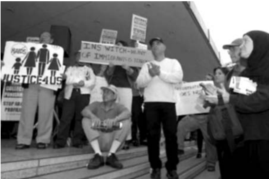
Protest against witchhunt of Arab-American men in front of the Immigration and Naturalization Service Los Angeles District Office, January 2003.

spread about a federal amnesty bill, as if it could really be won just by occasional lobbying and demonstrations. And after September 11, the reactionary labor bureaucracy went back to its real full-time job of touting U.S. imperialism uncritically.