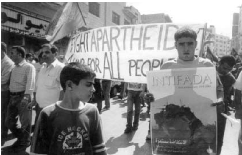
Palestinians demonstrate in defense of intifada.

The masses are well aware of the rulers' failures to defend the Palestinians but do not yet attribute this to their bourgeois character. They don't yet accept the need for socialist revolution, and they don't see that revolutionary proletarian states in the region would be the best defense the Palestinians could get. They believe that if the present regimes were less corrupt, more honest, braver or more subjected to mass pressure – and, as unfortunately increasing numbers seem to think, more Islamic – maybe more aid would be sent. Tragically, this is how the masses in the region have been misled. Yet they want the Palestinians to be armed and reinforced before thousands more are killed.