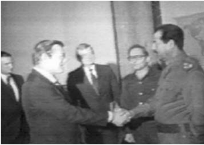
One war criminal greets another. Donald Rumsfeld was U.S. envoy to Iraq in 1983, sent to supply dictator Saddam Hussein with arms and military advice. Rumsfeld then did not protest Saddam's use of chemical "weapons of mass destruction" against Iran.

Latinos. (See page 24.) The butchering of thousands of Iraqi civilians and poorly equipped soldiers only intensifies the racist attitude that Arab lives, and consequently those of all people of color, don't matter. This will inevitably mean an intensification of racism in the U.S.