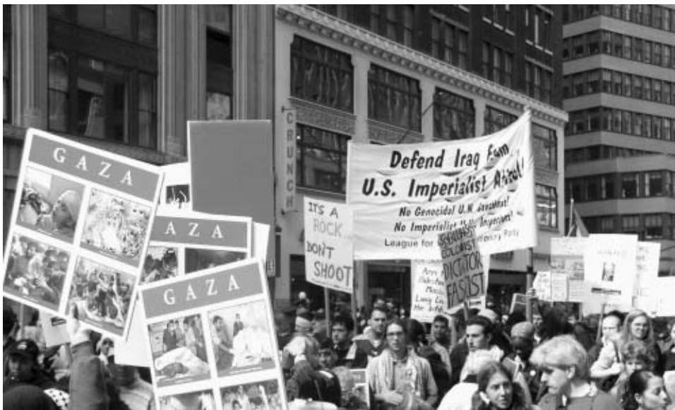
LRP marching with defenders of Palestine and Iraq in New York City, March 22.

As for “opportunist impulses that animate” socialists to imagine building a revolutionary leadership with pro-imperialist liberals, while this is a slanderous characterization of the LRP, it accurately describes the SL at times, depending on what position they think offers them some short-term gain. When the SL is confronted with coalitions and movements they can’t control, they adopt a sectarian posture: they stand outside the struggle and hurl condemnations from the safety of their newspaper office. But when they get a chance to run a coalition with liberal Democrats themselves, the Spartacists can adopt a thoroughly craven posture. Readers of PR may remember that in 1994, when Democratic Party liberals