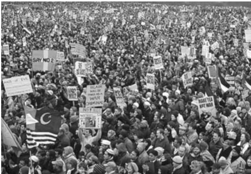
London, March 22: 500,000 denounce U.S.-British war against Iraq.

League for the Revolutionary Party, U.S. Communist Organization for the Fourth International (KOFI-BRD), Germany Revolutionary Workers Organization, Ukraine Revolutionary Workers Organization, Russia