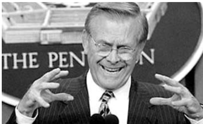
Rumsfeld, now U.S. "Defense" Secretary, plays key role in ruling class's grab for world empire.

The U.S. war drive met with unexpectedly strong opposition from rival ruling classes. British Prime Minister Blair and Secretary of State Powell, who were strongly seeking U.N. cover