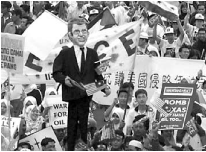
Anti-war demonstration in Malaysia, March 29, 2003

Washington's war moves. British capital is thoroughly interpenetrated with the American economy and intimately linked with U.S. investments abroad. Tony Blair's role as Washington's lap-dog is not a matter of personal subservience but an expression of British capital's economic interests, particularly in countering Germany's domination of the European Union.