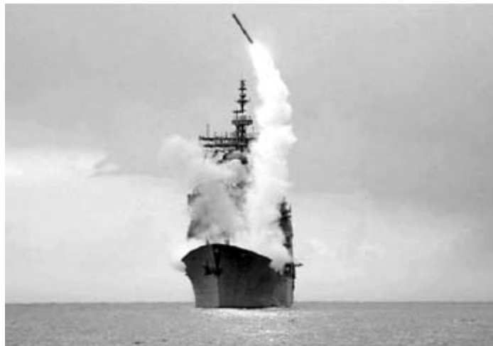
U.S. missile launched from Persian Gulf. War killed unknown thousands of Iraqis.

Anti-Arab racism whipped up after September 11 was used to justify the jailing and deportation of thousands of immigrants, and had already led to a rise in police brutality against Blacks and