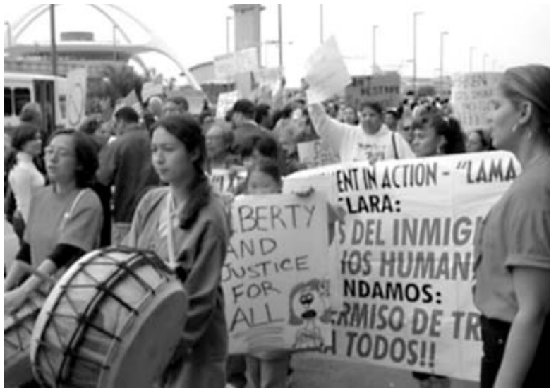
Demonstration at LAX airport in March 2002 protesting wave of attacks on immigrants in U.S.

To carry out its assaults without hindrance from constitutional protections, the federal government hurriedly passed new