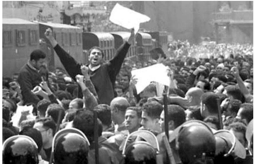
Cairo, Egypt, March 21: Ten thousand protested U.S. invasion of Iraq and fought police. The struggle against imperialism continues: U.S. Out of Iraq Now!

As capitalism's global economic crisis deepens, bloody wars will only be repeated on a larger scale. This war signals increasing imperialist aggression against the "third world." It also points to growing rivalries among the competing world powers which, if