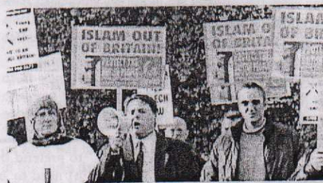
Racist BNP March

Now in Burnley the Labour Council says it won't work with the BNP councillors. Only a movement of the local community in Burnley can hold them to that.